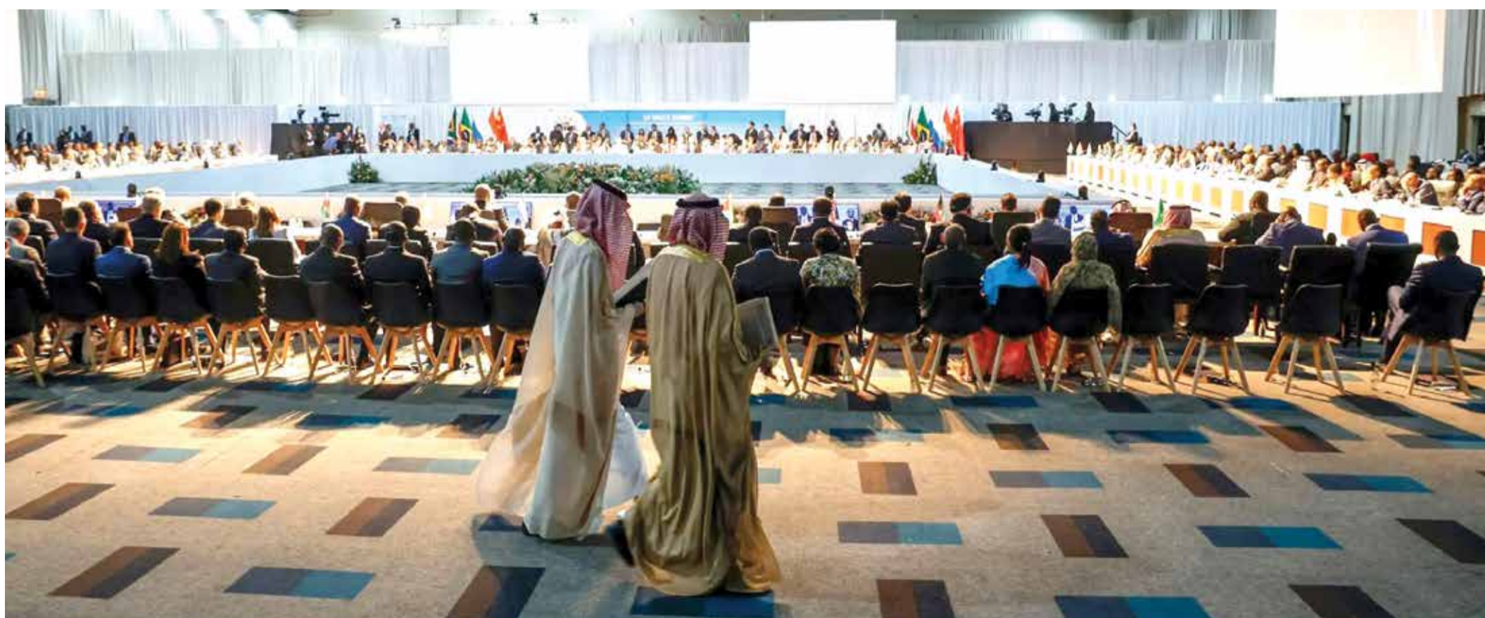
Delegates attend a meeting during the BRICS Summit at the Sandton Convention Centre in Johannesburg, South Africa, on August 24, 2023.

As BRICS embraces new members, discussions revolved around how this expansion could further enhance the association's influence on the global stage. The BRICS Foreign Ministers' Meeting, convened in Nizhny Novgorod, Russia, from June 10 to 11, served as a platform for participants to deliberate on various international issues and explore cooperation opportunities within the group. The agenda of the meeting, as indicated by the Russian Foreign Ministry, focused on key topics on the international agenda and practical collaboration among BRICS nations. Economic and geopolitical power is increasingly decentralized in a rapidly changing global landscape, and groups like BRICS cannot be overstated. With their combined influence spanning around 30 percent of the Earth's landmass, 45 percent of its population, and a remarkable 33 percent of global GDP, BRICS nations are emerging as critical players in shaping the future of international relations and global governance. As representatives convened for a pivotal meeting hosted by Russia, it's imperative to highlight the positive impact BRICS is poised to make on the world stage.