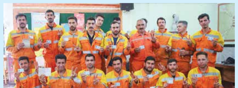
Bojnourd ● MIZAN