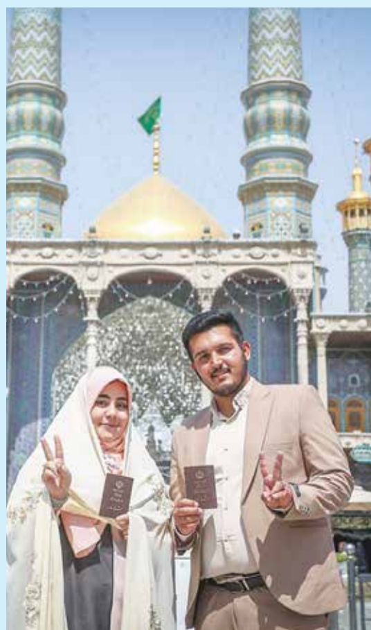
Qom ● MIZAN