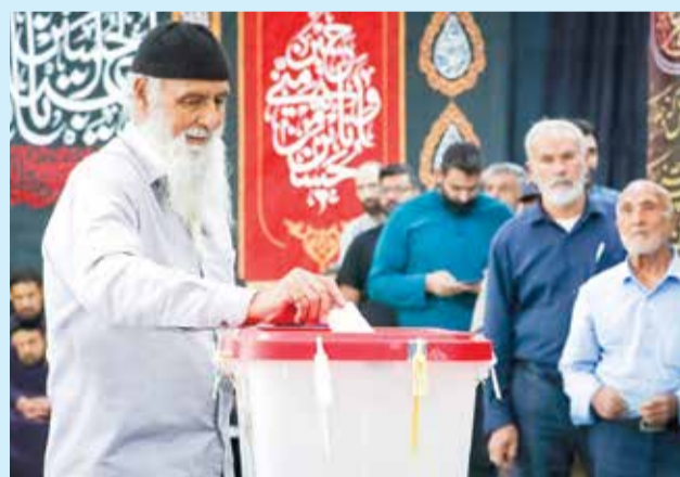
Abadan ● MIZAN