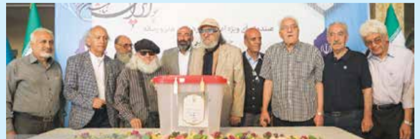
Tehran ● ISNA