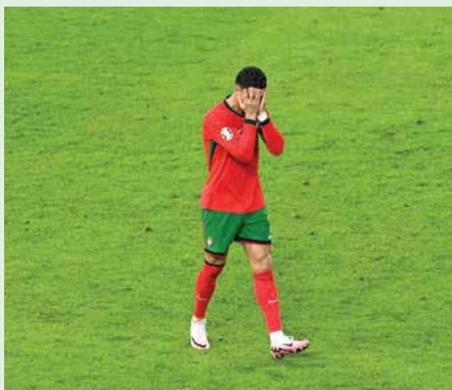
Portugal's Cristiano Ronaldo looks dejected during a last-16 defeat against France in Euro 2024 in Hamburg, Germany, on July 5, 2024.

"It's too soon and raw after the match to talk about that and there have been no individual decisions made," coach Roberto Martinez said when asked if it had been Ronaldo's last game