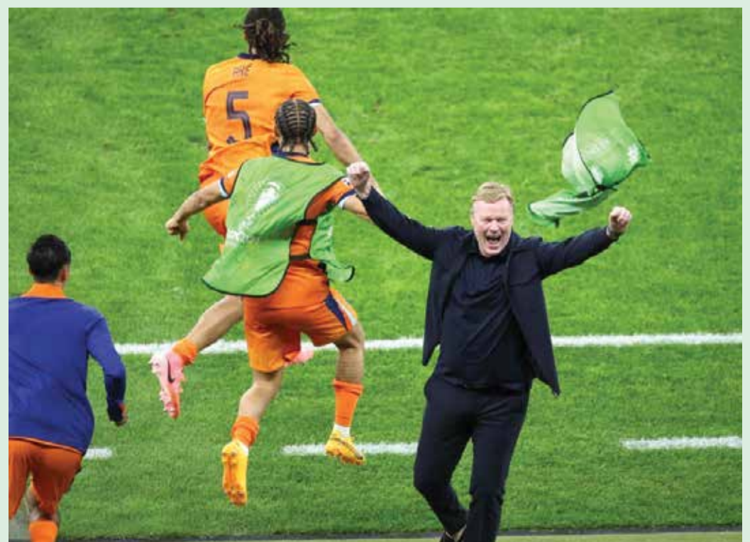
● NETHERLANDS' head coach Ronald Koeman celebrates his team's last-eight victory over Turkey in Euro 2024 in Berlin, Germany, on July 6, 2024.

The Turkey manager, Vincenzo Montella, whose players were denied by some last-ditch defending and a brilliant stoppage-time save from Bart Verbruggen, saw honour in defeat. "I think we are among the top five in the European Championship," he said. "We are proud that we have gained an identity by feeling our whole country behind us and adopting our strategy. Our players should be kissed on the forehead. We should be really proud: we have come this far, but could have achieved even more."