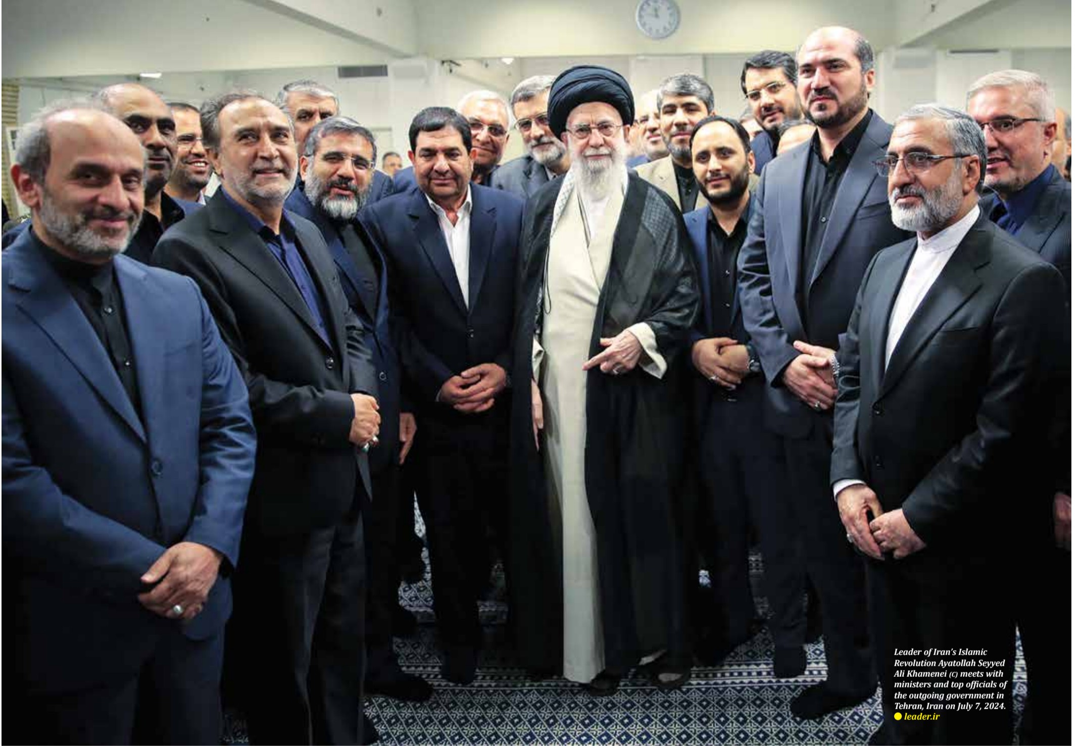
Leader of Iran's Islamic Revolution Ayatollah Seyyed Ali Khamenei (c) meets with ministers and top officials of the outgoing government in Tehran, Iran on July 7, 2024. ● leader.ir