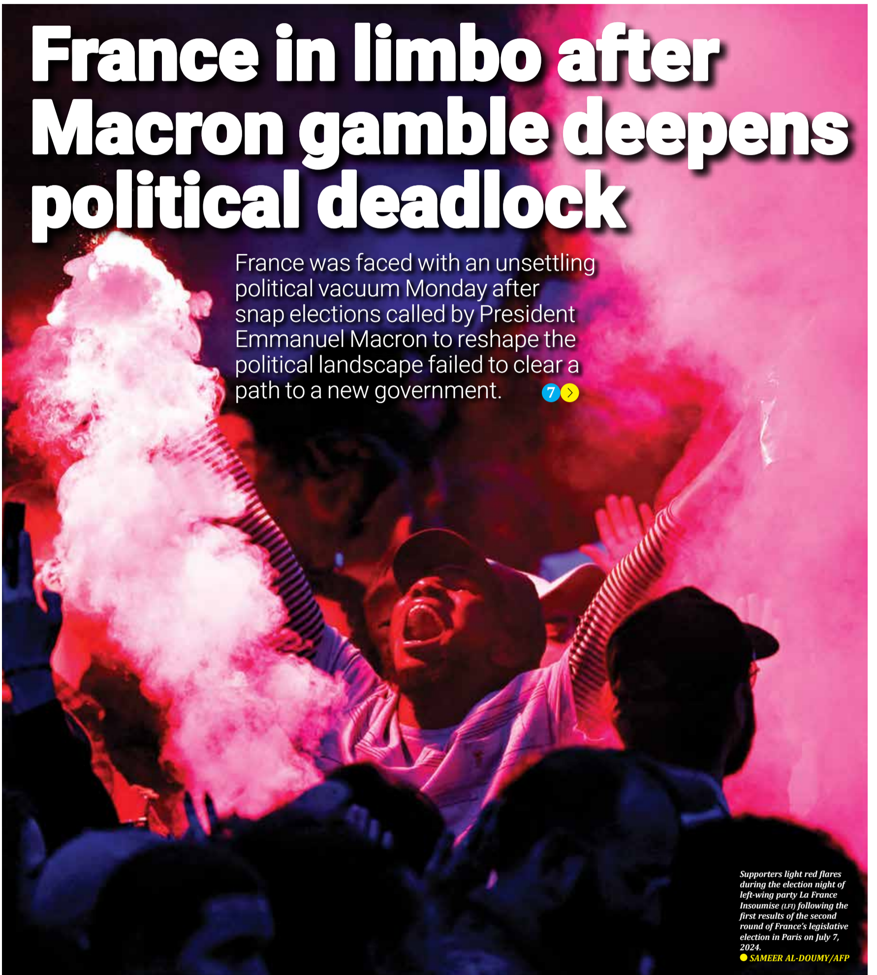
Supporters light red flares during the election night of left-wing party La France Insoumise (LFI) following the first results of the second round of France's legislative election in Paris on July 7, 2024.