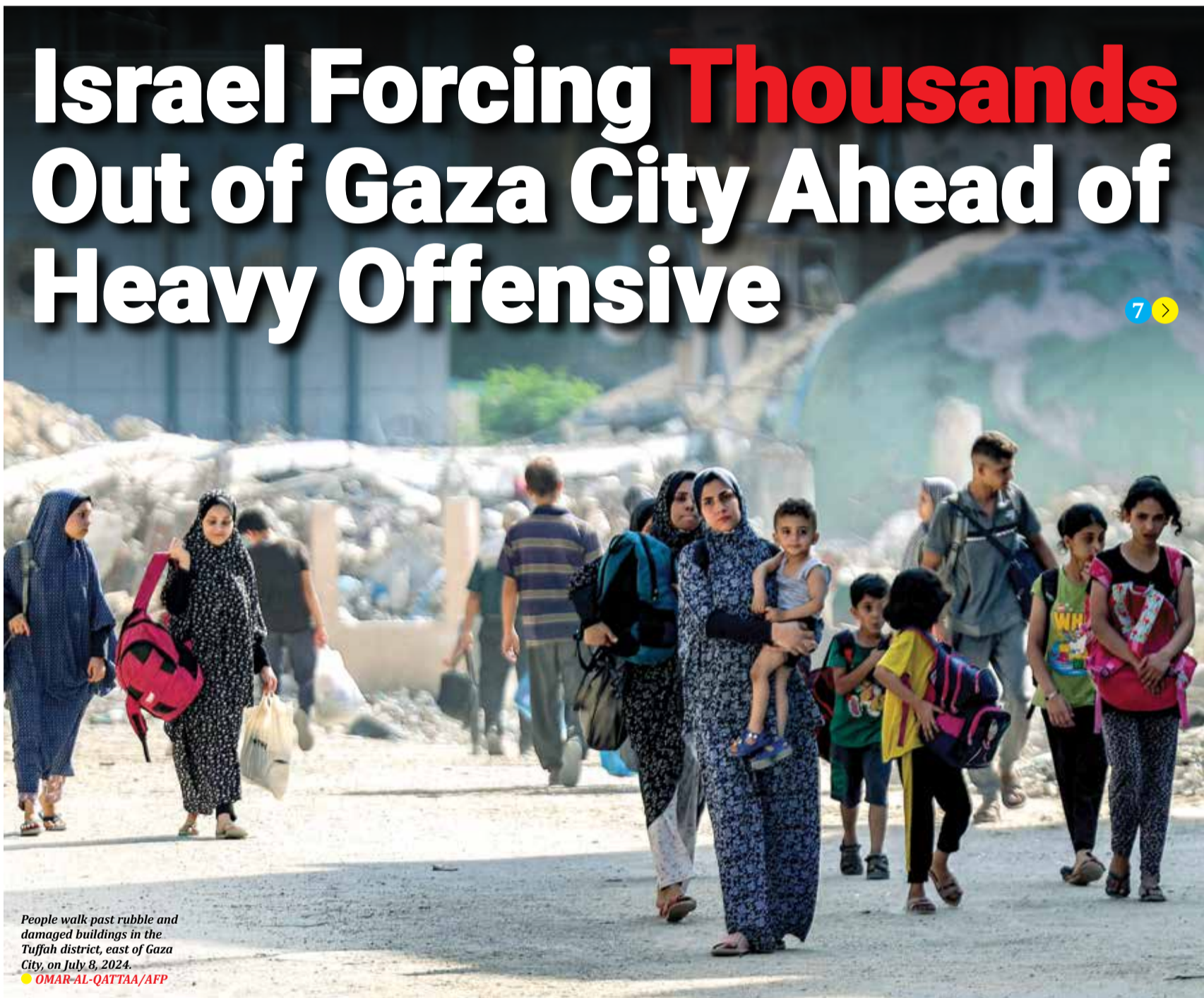
People walk past rubble and damaged buildings in the Tuffah district, east of Gaza City, on July 8, 2024.