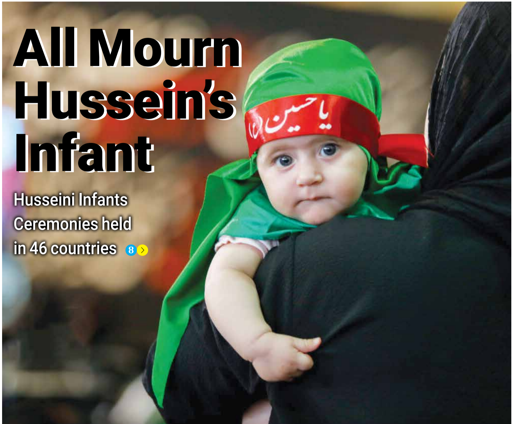
An Iranian infant, in her mother's arms, participates in the Husseini Infants Ceremony, held in Tehran on the first Friday of the Islamic month of Muharram, which falls on July 12, 2024.

Husseini Infants Ceremonies held in 46 countries 8 >