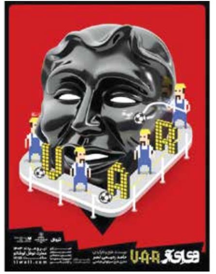
assistant referee system used in football, and the story revolves around the theme that a tree is just an image, and one cannot climb it.

The play's title, 'VAR,' refers to the video