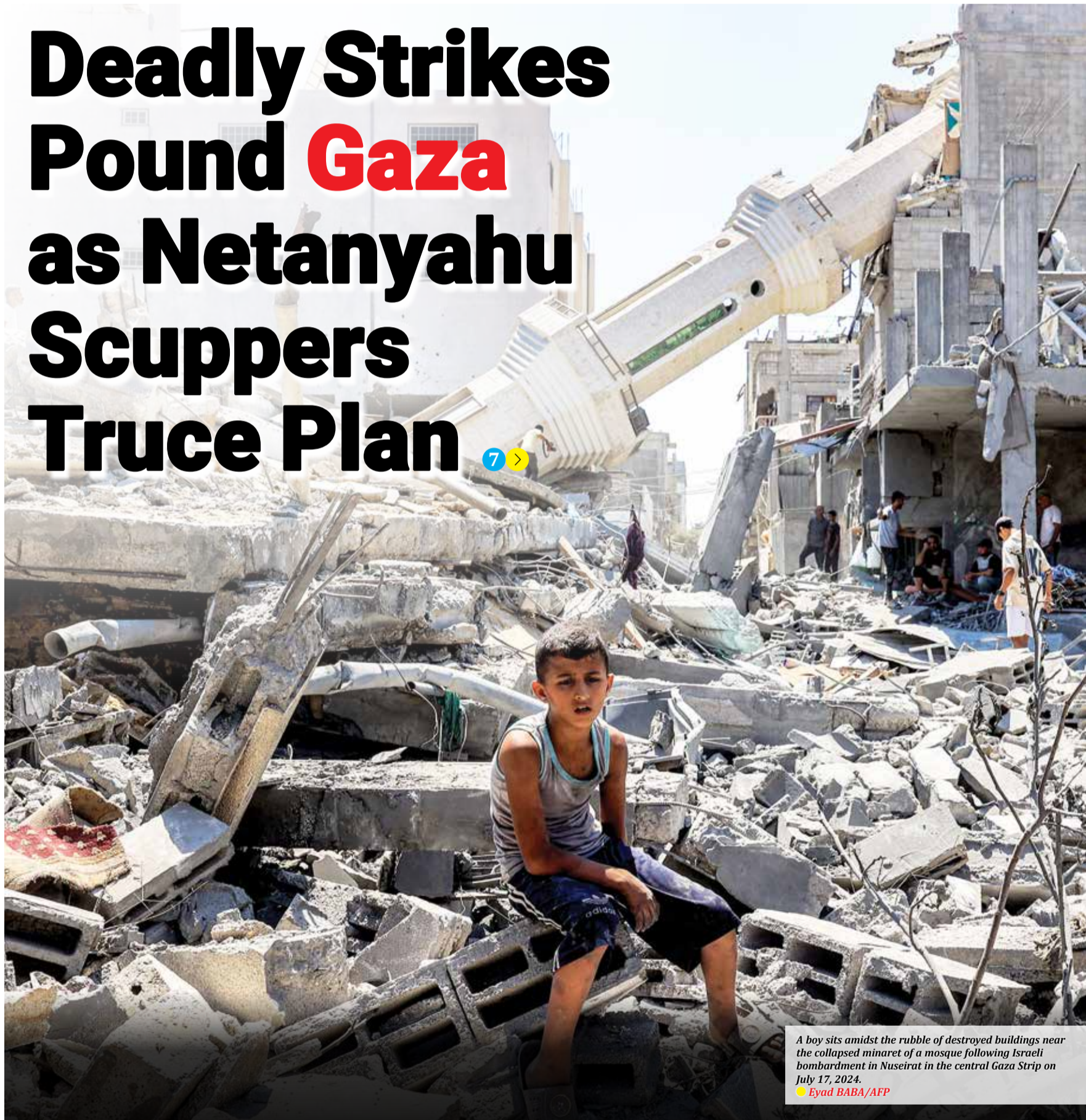
A boy sits amidst the rubble of destroyed buildings near the collapsed minaret of a mosque following Israeli bombardment in Nuseirat in the central Gaza Strip on July 17, 2024.