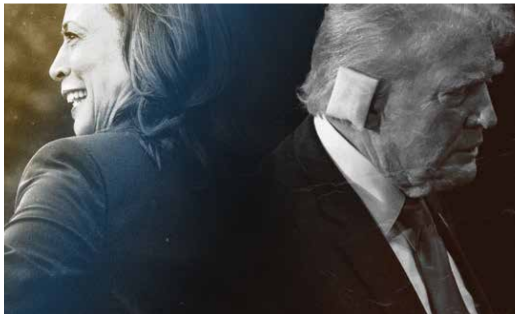
The article first appeared on The New York Times.

attorney general of California. She parted ways with a swath of the senior team on her 2020 presidential primary run, which was wracked with infighting. Those who have worked both for and against her say she has few equivalents when she nails a big speech, or delivers an acerbic line on the debate stage or at a committee hearing. But they also say she can get in her own head, retreat back to canned comments, and make tentative, self-inflicted mistakes. Now, she is inheriting Mr. Biden's enormous campaign apparatus. And she has little more than 100 days to capture both the Democratic nomination and the presidency.