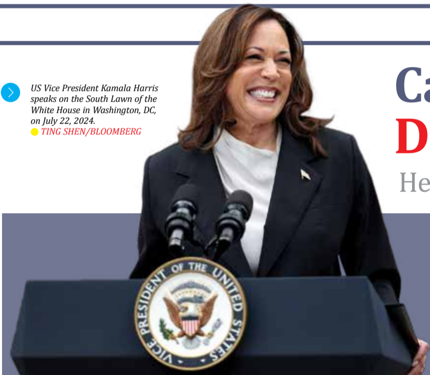
US Vice President Kamala Harris speaks on the South Lawn of the White House in Washington, DC, on July 22, 2024.