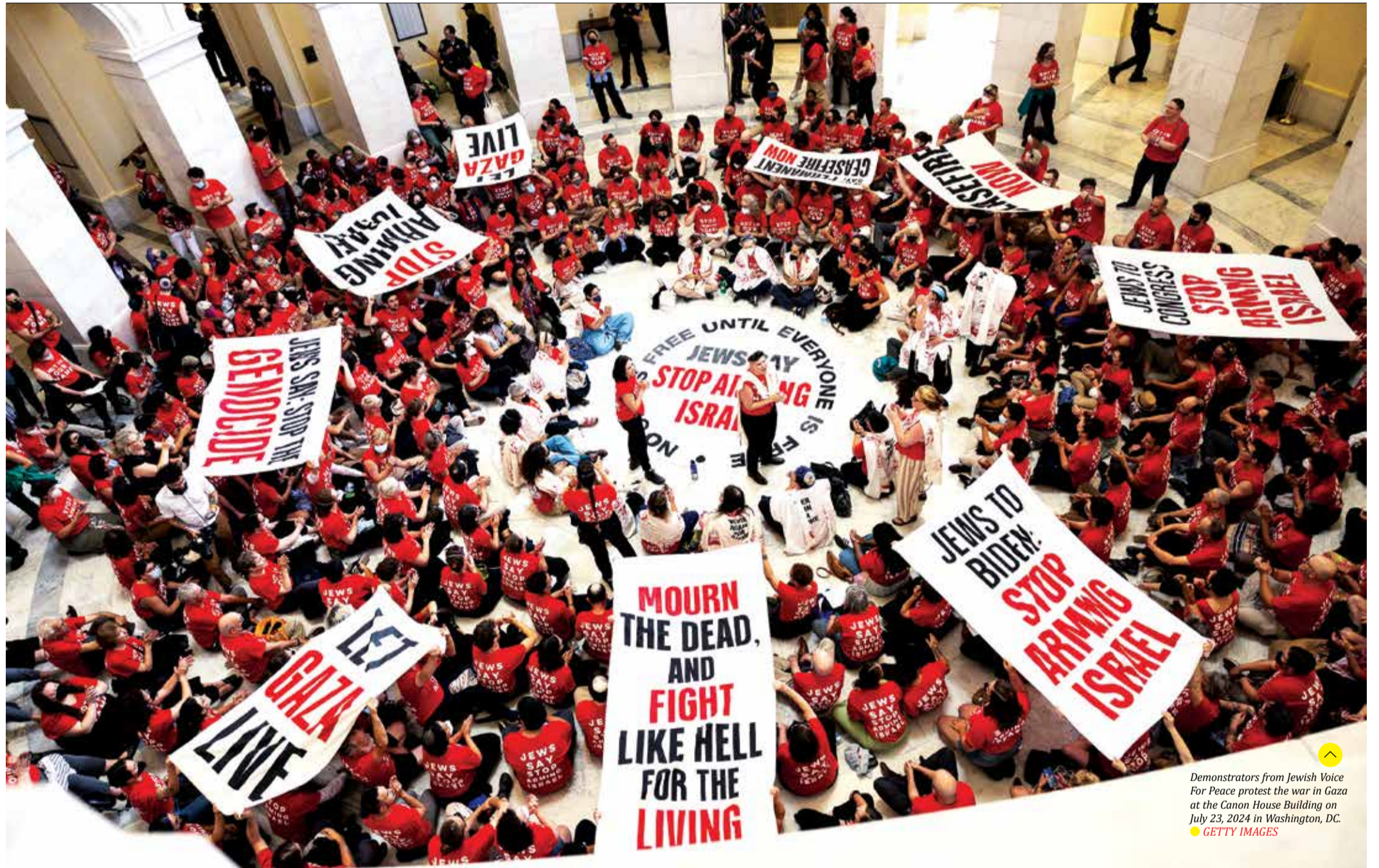
Demonstrators from Jewish Voice For Peace protest the war in Gaza at the Canon House Building on July 23, 2024 in Washington, DC.