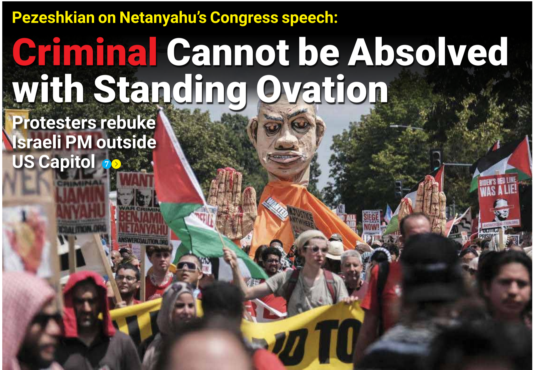
Protesters demonstrate on Capitol Hill on July 24, 2024 in Washington, DC to protest Israeli Prime Minister Benjamin Netanyahu's visit to the United States amid Israel's ongoing war on the Gaza Strip.

Protesters rebuke Israeli PM outside US Capitol 7 >