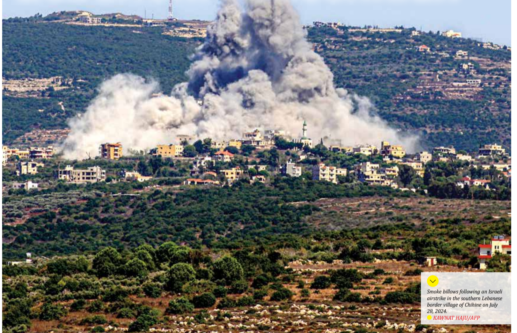
Smoke billows following an Israeli airstrike in the southern Lebanese border village of Chihine on July 28, 2024.