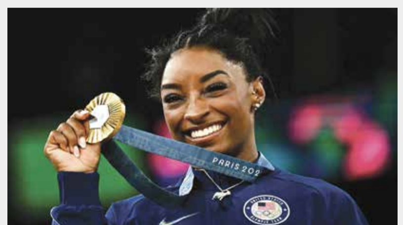
American Simone Biles poses with her gold medal after the artistic gymnastics women's all-around final at the Paris Olympics on Aug. 1, 2024.