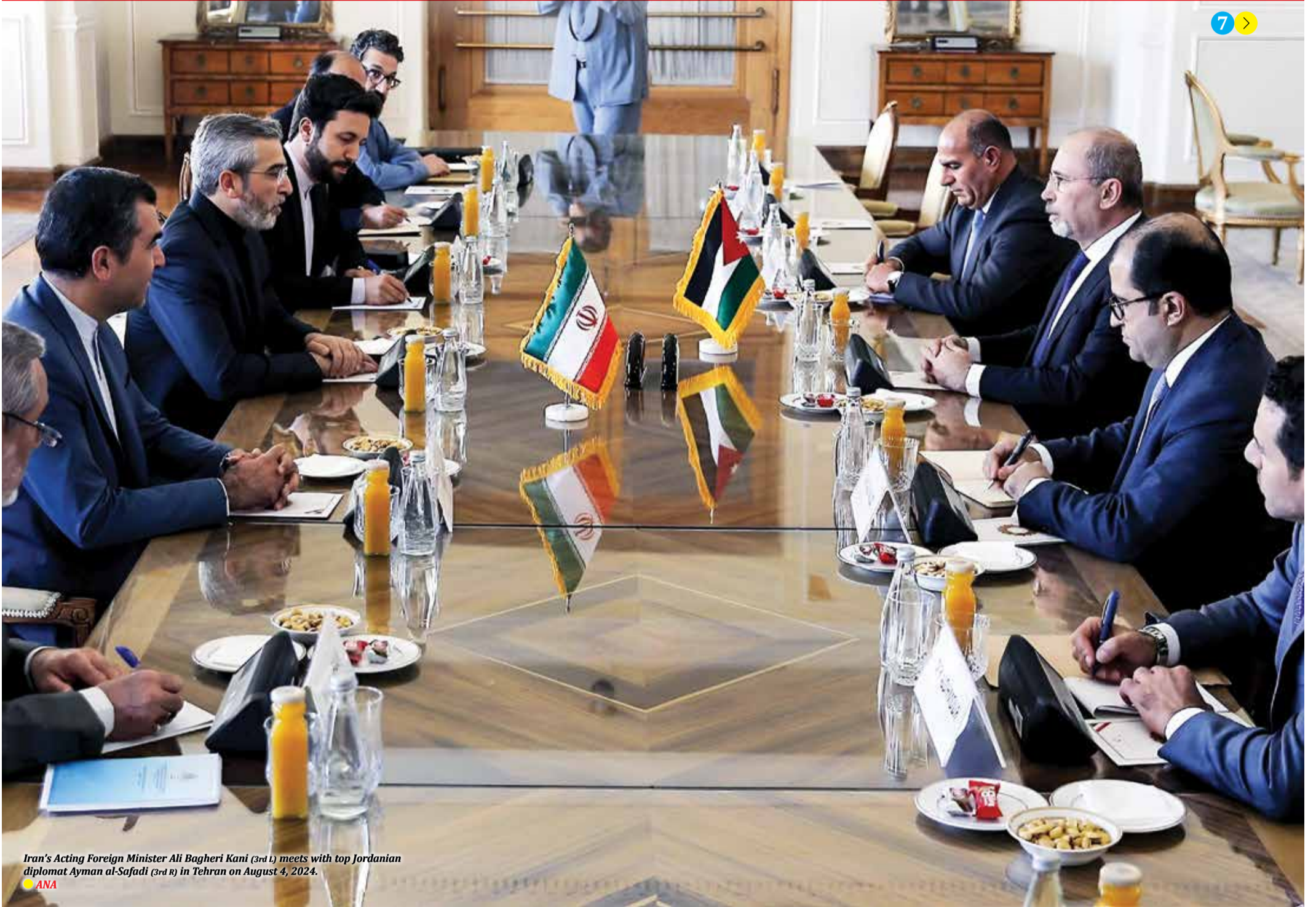
Iran's Acting Foreign Minister Ali Bagheri Kani (3rd L) meets with top Jordanian diplomat Ayman al-Safadi (3rd R) in Tehran on August 4, 2024.