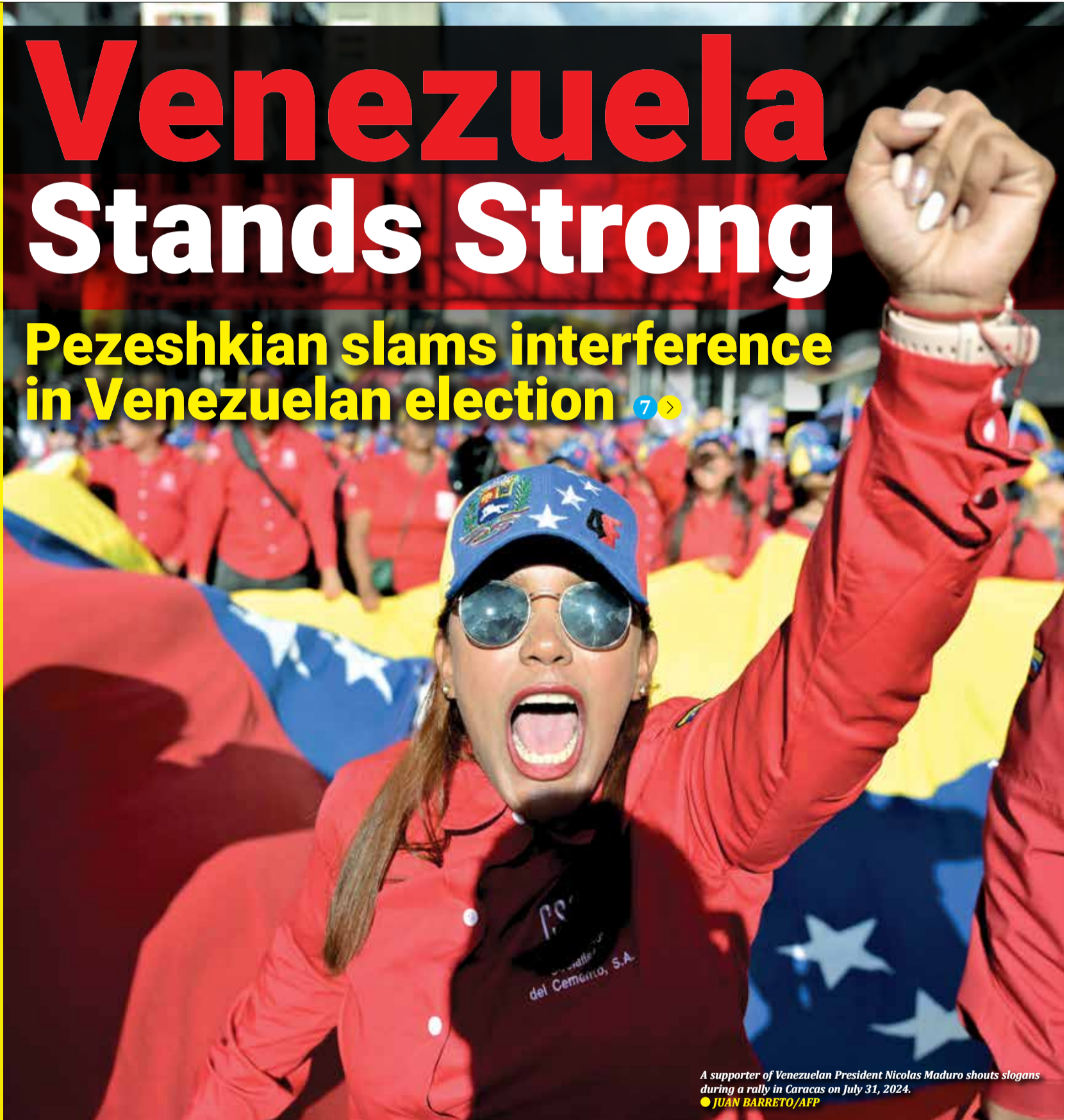
A supporter of Venezuelan President Nicolas Maduro shouts slogans during a rally in Caracas on July 31, 2024.