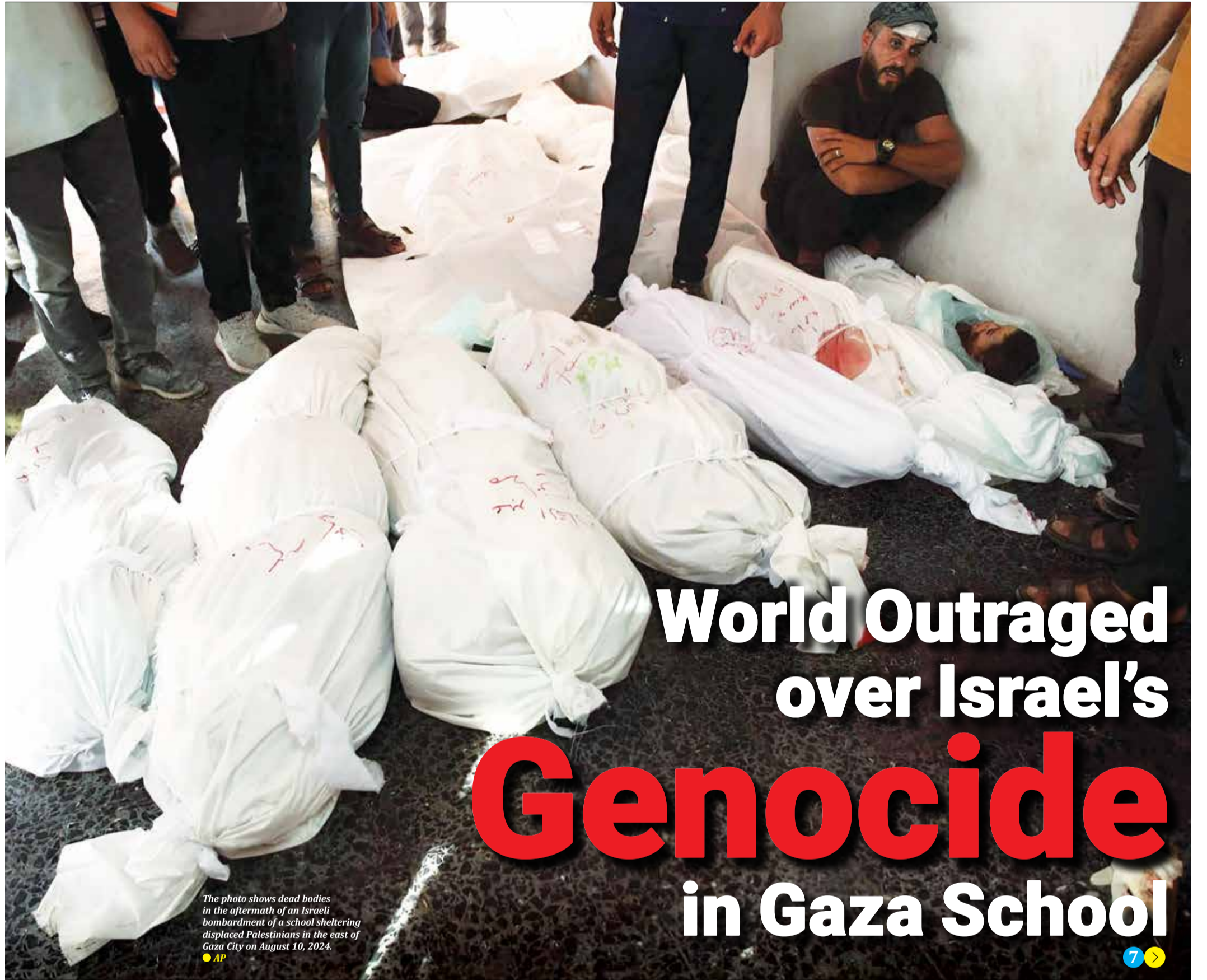
The photo shows dead bodies in the aftermath of an Israeli bombardment of a school sheltering displaced Palestinians in the east of Gaza City on August 10, 2024.