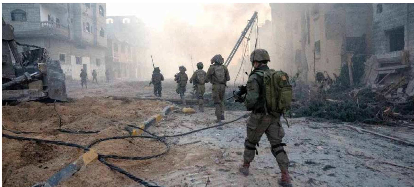
Israeli soldiers operate amid a billowing smoke in the Gaza Strip on January 21, 2024.

“The strategic planning of Iran and the Resistance forces, combined with the current air of ambiguity and uncertainty regarding the nature and scale of their response, has instilled fear in the United States and its Zionist allies. As a result, the latter side is attempting to promote narratives such as “both sides should exercise restraint,” “tensions can be avoided,” “the world needs stability and peace,” and “the goal should be a cease-fire in Gaza,” alongside claims that “Israel has the right to defend itself”.