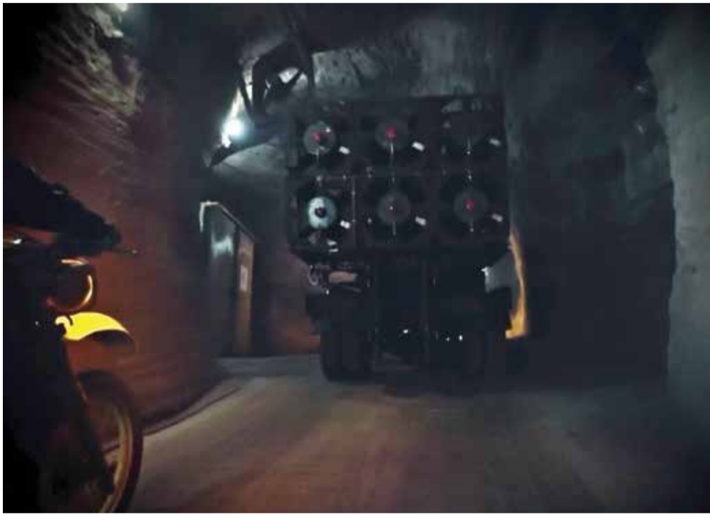
A Hezbollah motorcycle follows a multiple rocket launcher down a tunnel in a video released by Hezbollah on August 16, 2024.