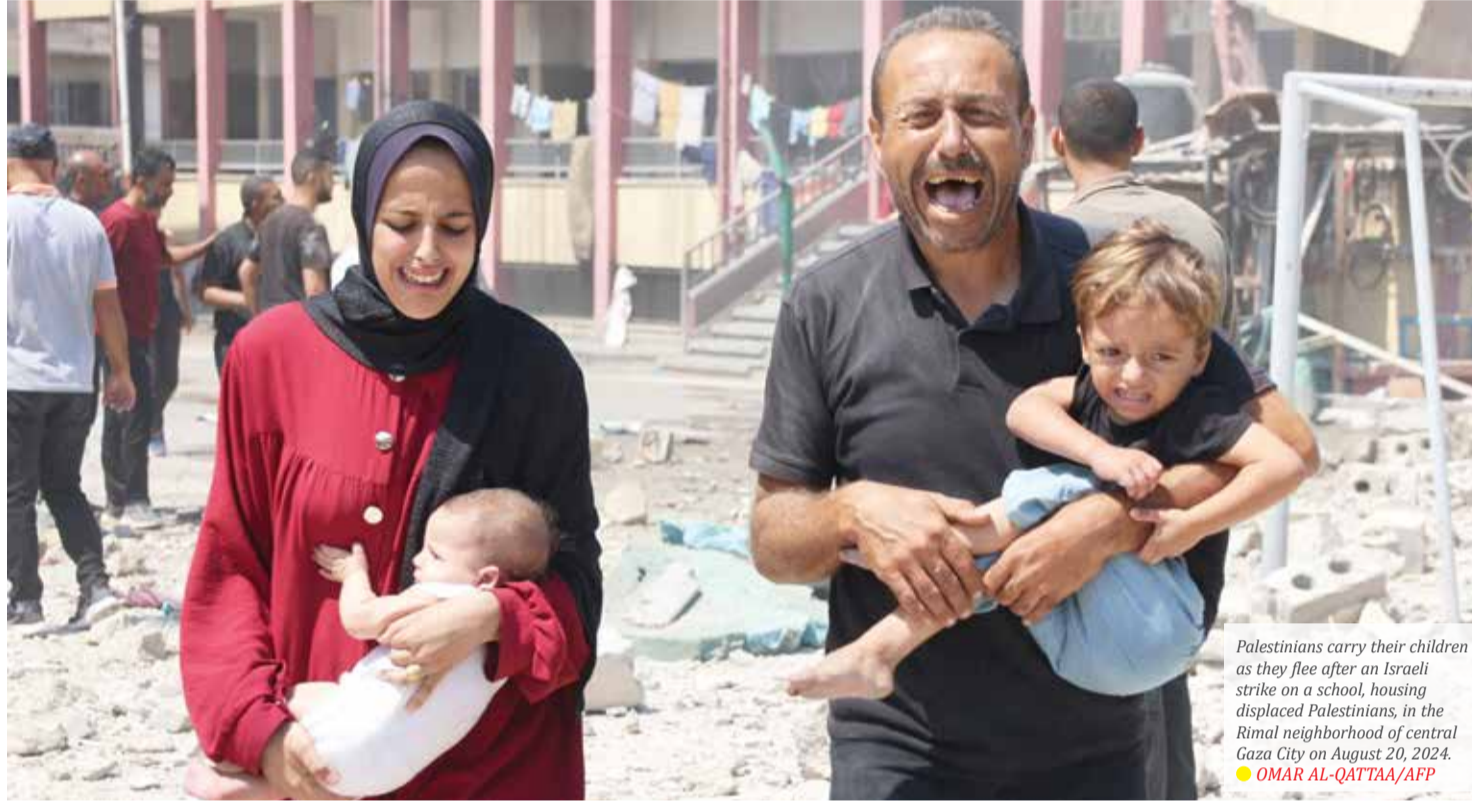
Palestinians carry their children as they flee after an Israeli strike on a school, housing displaced Palestinians, in the Rimal neighborhood of central Gaza City on August 20, 2024.

Biden remarks 'green light' for Israel to continue war: Hamas