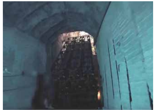
A multiple rocket launcher belonging to Hezbollah raises into the firing position, below an aperture in the roof of a tunnel in a video released by Hezbollah on August 16, 2024.

Since the assassination of Hezbollah military commander Fuad Shukr in Beirut by Israel on July 30, the group has threatened some kind of retaliation against Israel. This could involve a joint effort with Hamas, whose political leader Ismail Haniyeh was assassinated in Tehran a day after the killing of Shukr. At the same time, there is the continued specter of a massive