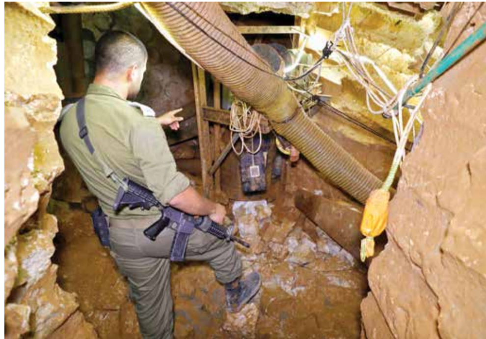
A picture taken on a June 2019 guided tour with the IDF shows the interior of a Hezbollah tunnel on the Israeli side of the border with Lebanon in northern Israel.

The powerful Lebanese resistance group Hezbollah has, in a recent display of force, unveiled footage of its underground missile facility, showcasing its military might as tensions flare with the Israeli military alongside the ongoing Gaza conflict. In a video lasting nearly five minutes, Hezbollah flaunts its capabilities, featuring fighters on motorcycles and with laptops, navigating a network of rocky tunnels alongside a fleet of trucks. The video culminates with the reveal of an underground launch site, where trucks with rocket launchers emerge from a maze of tunnels.