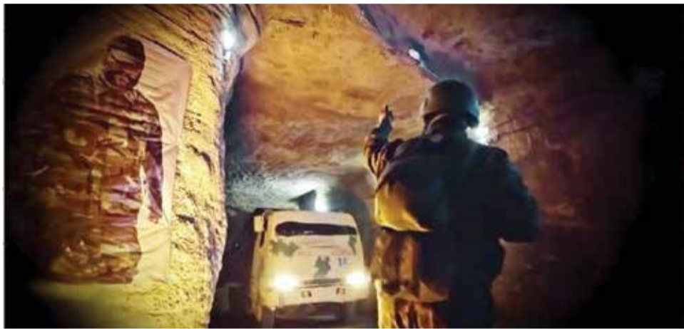
This frame grab from a video released by Hezbollah on August 16, 2024, shows the Lebanese Resistance movement's new underground missile facility.

"These targets are in our possession, and these missiles are placed, deployed, and focused on targets in perfect security," the video adds.