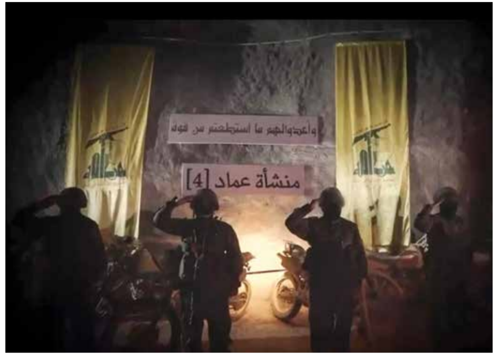
Hezbollah's soldiers give a military salute in front of their motorcycles inside a tunnel in a video released by Hezbollah on August 16, 2024.