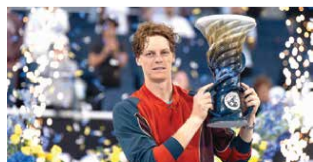
Jannik Sinner of Italy poses with the Cincinnati Open trophy after beating Frances Tiafoe in Cincinnati, OH, US, on Aug. 19, 2024.