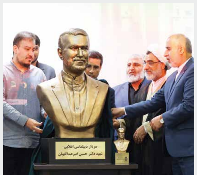
A bust of the late Iranian foreign minister Hossein Amir-Abdollahian is unveiled in Tehran, Iran, on August 20, 2024. Amir-Abdollahian died in a helicopter crash in northwestern Iran on May 19, along with former Iranian president Ebrahim Raisi.

trary to be true. In a statement, the ministry said it banned the Hamburg Islamic Center and its affiliated organizations throughout Germany accusing it for being "an Islamist extremist organization pursuing anti-constitutional objectives".