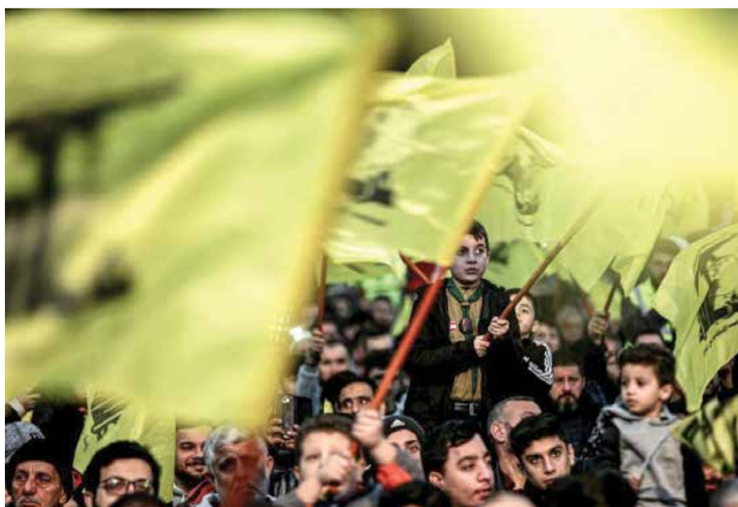
Supporters of Lebanon's Hezbollah movement gather at a rally on January 3, 2023.

As tensions rise, Israel finds itself facing a formidable foe, as described by the Media Line, an independent American news agency specializing in Middle Eastern coverage. With Hezbollah's army of "tens of thousands of soldiers and over 100,000 missiles," Israel is confronted with a significant military challenge.