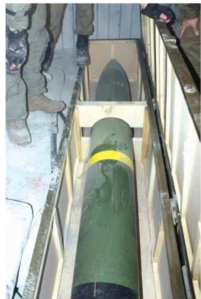
An apparent Khaibar-1 rocket is seized by Israeli security forces aboard a ship in the Red Sea, about 930 miles from the Israeli coast in March 2014.

The article first appeared on The War Zone .