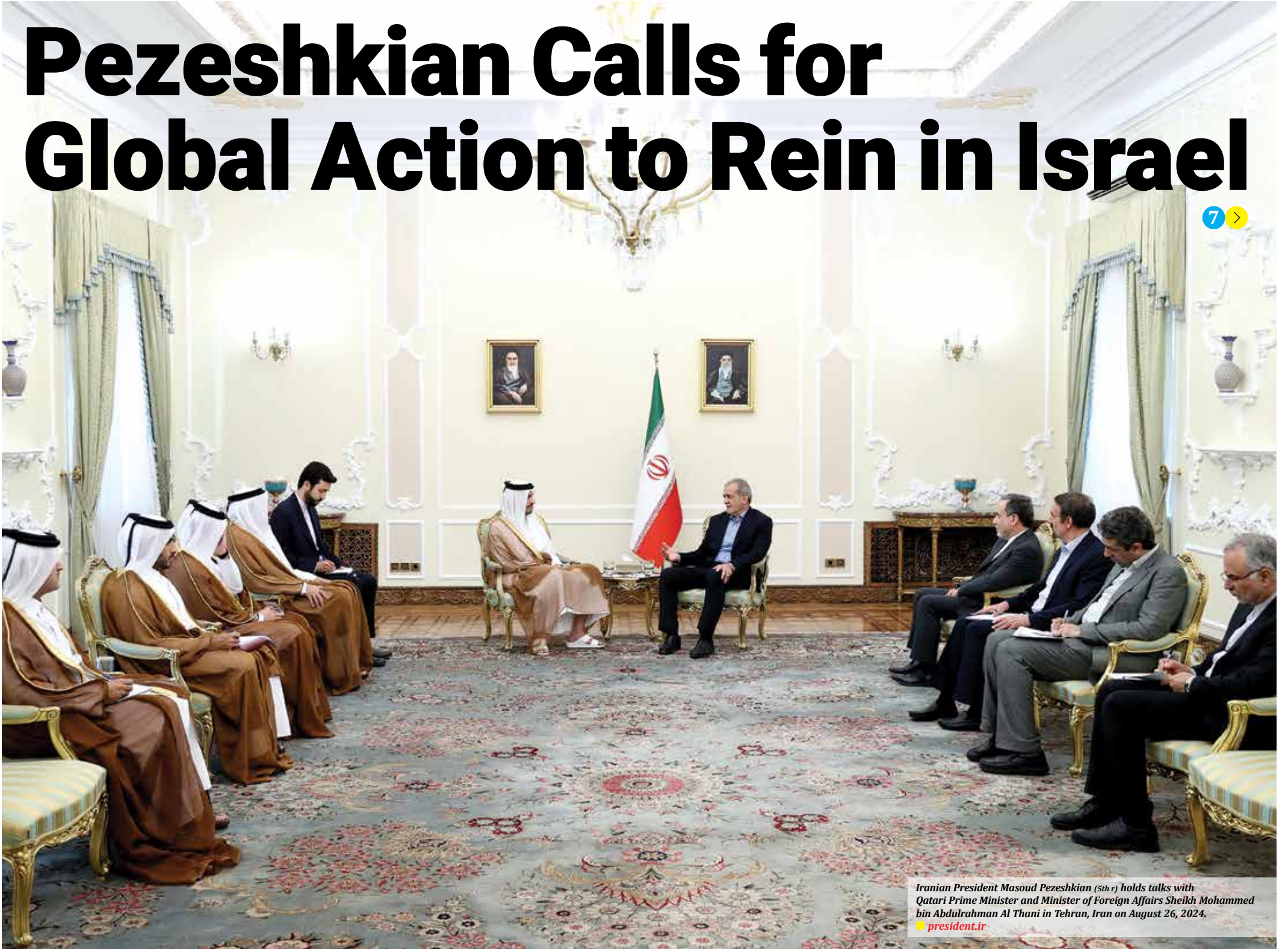
Iranian President Masoud Pezeshkian (5th r) holds talks with Qatari Prime Minister and Minister of Foreign Affairs Sheikh Mohammed bin Abdulrahman Al Thani in Tehran, Iran on August 26, 2024.