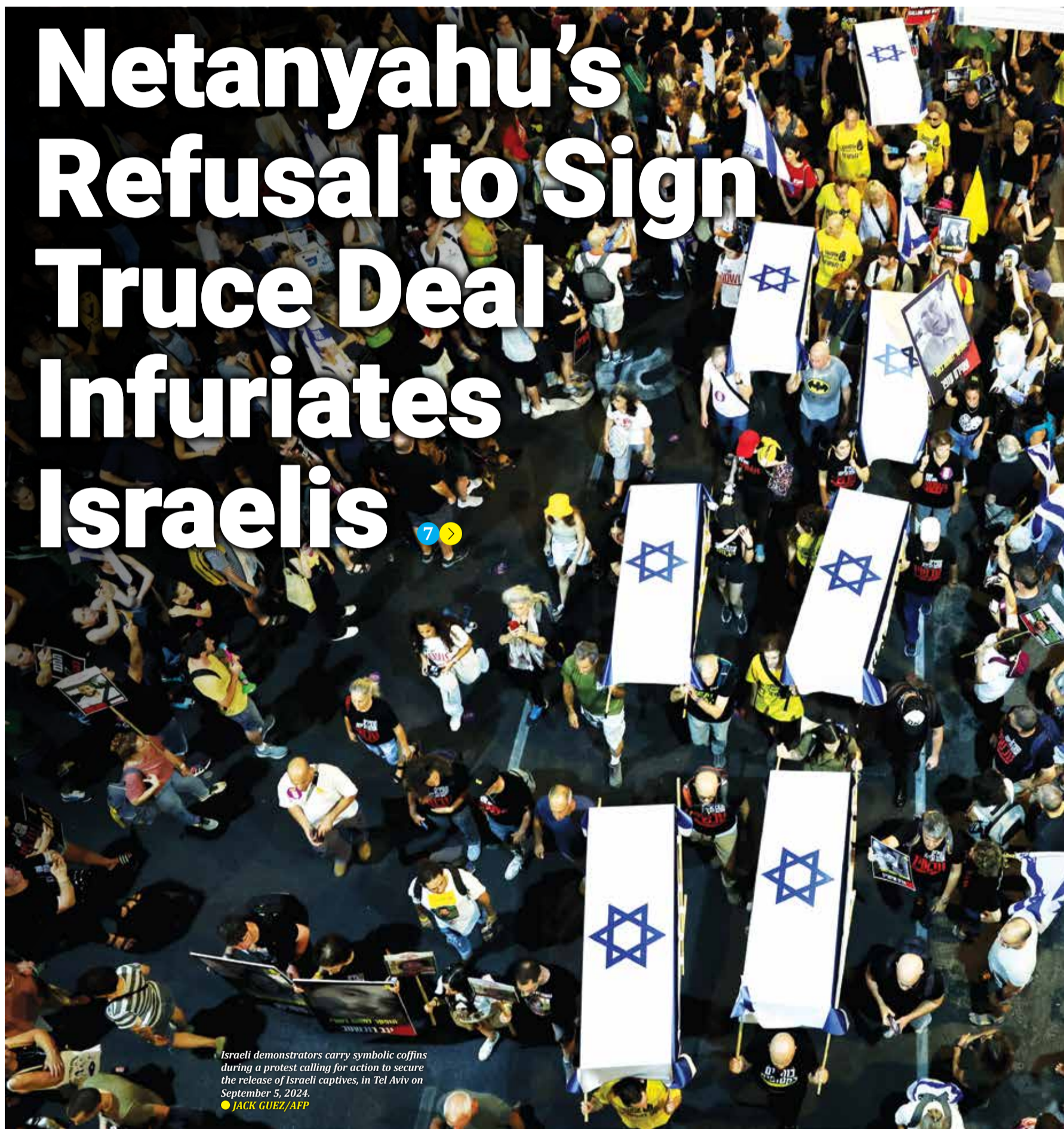
Israeli demonstrators carry symbolic coffins during a protest calling for action to secure the release of Israeli captives, in Tel Aviv on September 5, 2024.