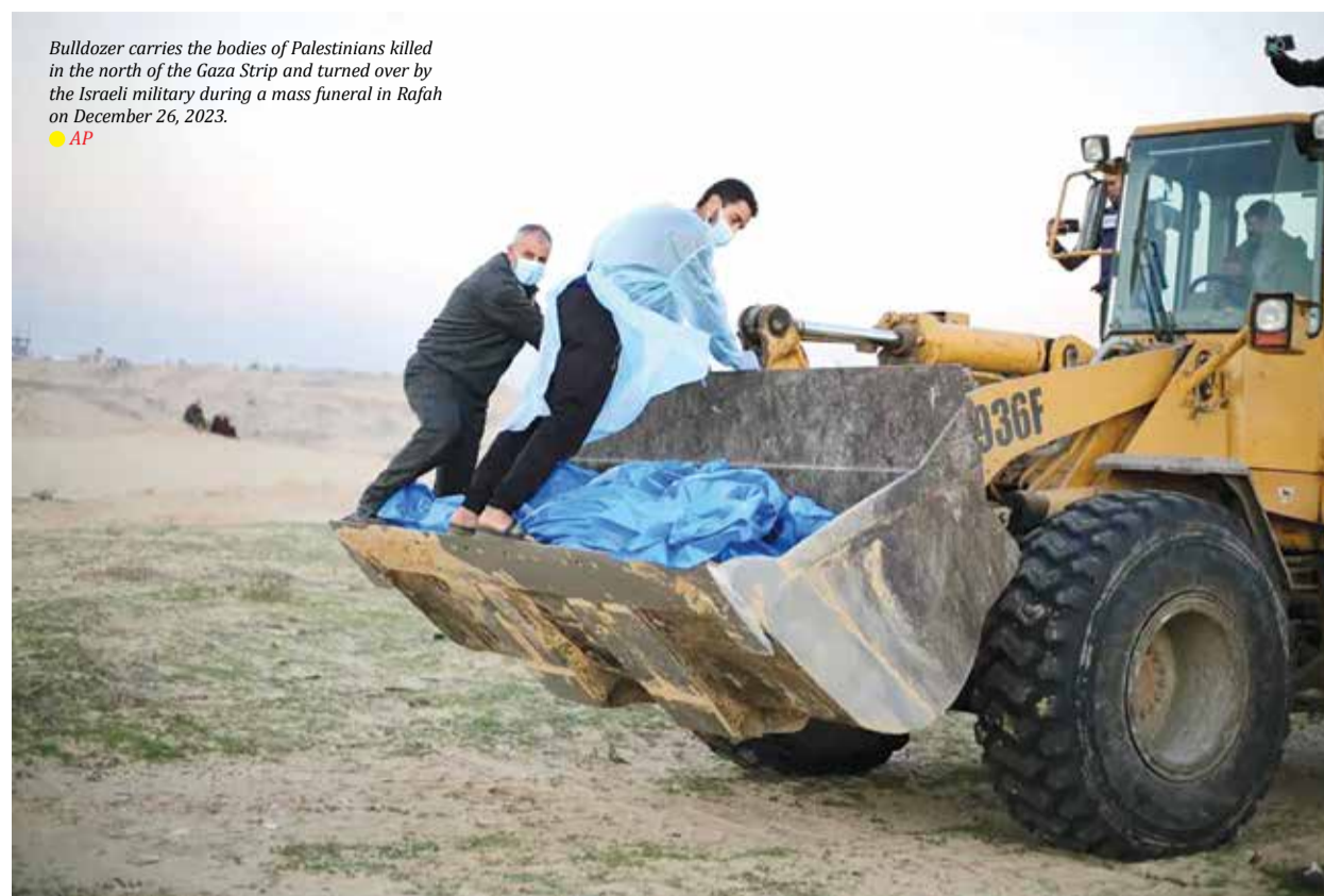
Bulldozer carries the bodies of Palestinians killed in the north of the Gaza Strip and turned over by the Israeli military during a mass funeral in Rafah on December 26, 2023.

In a poll eight years ago in 2016, an undisputed majority of Jewish Israelis (79%) believed that Jews are entitled to "preferential treatment" over non-Jews. When asked if Palestinians should