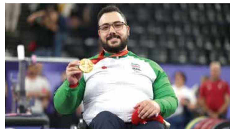
Iranian powerlifter Rouhollah Rostami poses with the men's -80kg gold medal in the Paris Paralympics on September 6, 2024.