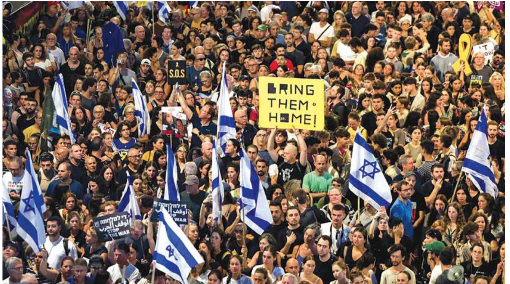
Protesters rally in Tel Aviv on September 1, 2024 after six Israeli captives were found dead in Gaza earlier that day.

In July 2014, shortly after the kickoff of Israel's "Operation Protective Edge" in the Gaza Strip — a 51-day affair that ultimately killed 2,251 Palestinians, including 551 children — Danish journalist Nikolaj Krak penned a dispatch from Israel for the Copenhagen-based Kristeligt Dagblad newspaper. Describing the scene on a hill on the outskirts of the Israeli city of Sderot near the Gaza border, Krak noted that the area had been "transformed into something that most closely resembles the front row of a reality war theatre". Israelis had "dragged camping chairs and sofas" to the hilltop, where some spectators sat "with crackling bags of popcorn," while others partook of hookahs and cheerful banter. Fiery, earth-shaking air strikes on Gaza across the way were met with cheers and "solid applause". To be sure, Israelis have always enjoyed a good murderous spectacle — which is hardly surprising for a nation whose very existence is predicated on mass slaughter. But as it turns out, the applause is not quite so solid when Israeli lives are caught up in the explosive apocalyptic display.