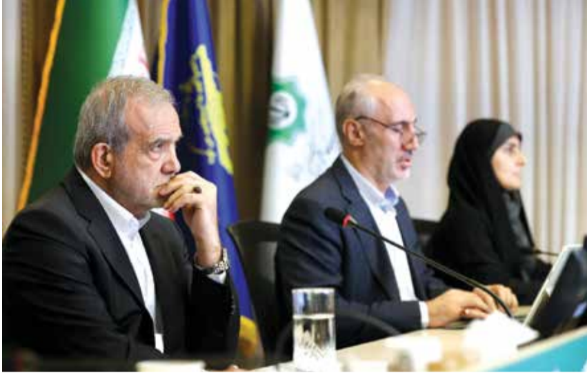
Iran's President Masoud Pezeshkian (L) attends a meeting with officials of the Khatam al-Anbiya Headquarters, the construction arm of the Islamic Revolution Guards Corps (IRGC) in Tehran on September 7, 2024.