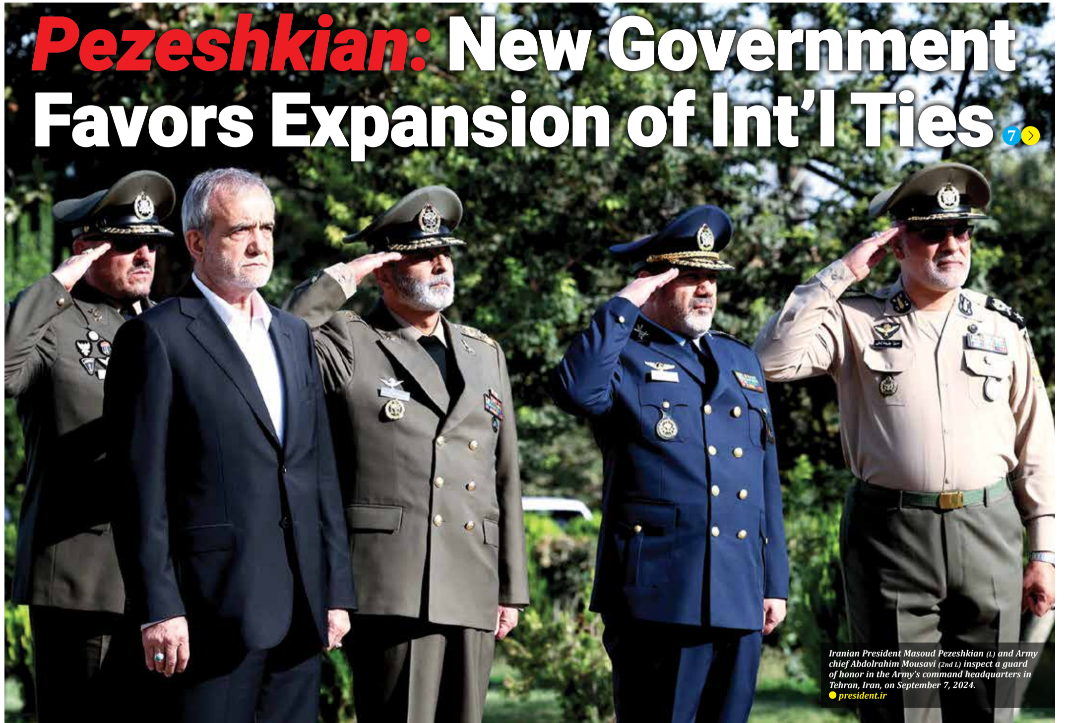
Iranian President Masoud Pezeshkian (1) and Army chief Abdolrahim Mousavi (2nd L) inspect a guard of honor in the Army's command headquarters in Tehran, Iran, on September 7, 2024.