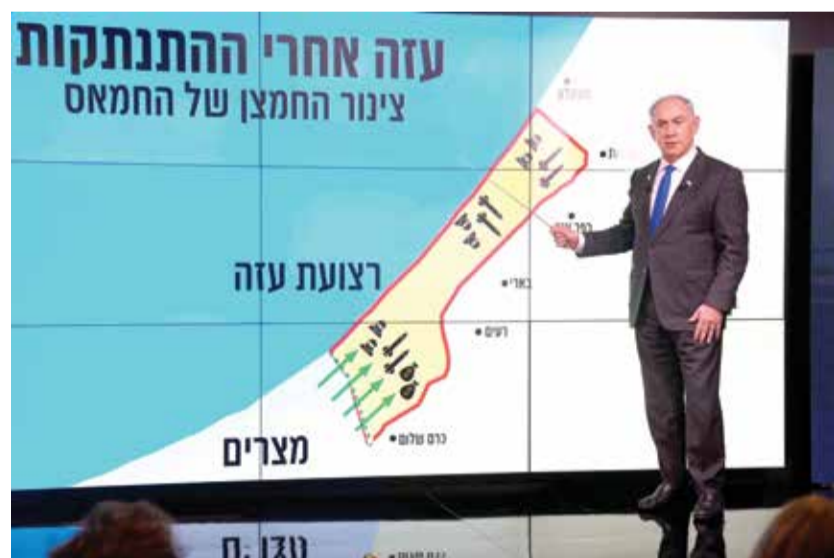
Israeli Prime Minister Benjamin Netanyahu stands before a map of the Gaza Strip during a news conference in Al-Quds (Jerusalem) on September 2, 2024.

According to Israeli paper Yedioth Ahronoth, Israel and Hamas negotiators were close to reaching a deal in July when, at the last minute, Netanyahu introduced a number of demands that would be non-starters for other parties to the negotiations. The demands included Israeli control over the Philadelphi corridor — a strip of Palestinian land encompassing the entirety of Gaza's border with Egypt. This would effectively give Israel control over the entirety of the Gaza border.