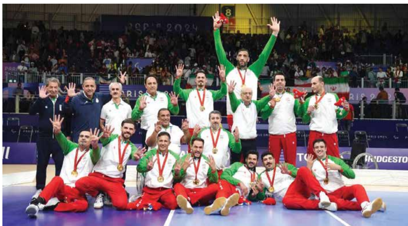
Iranian sitting volleyball players and coaching staff celebrate after beating Bosnia & Herzegovina in the men's final in the Paris Paralympics on September 6, 2024.