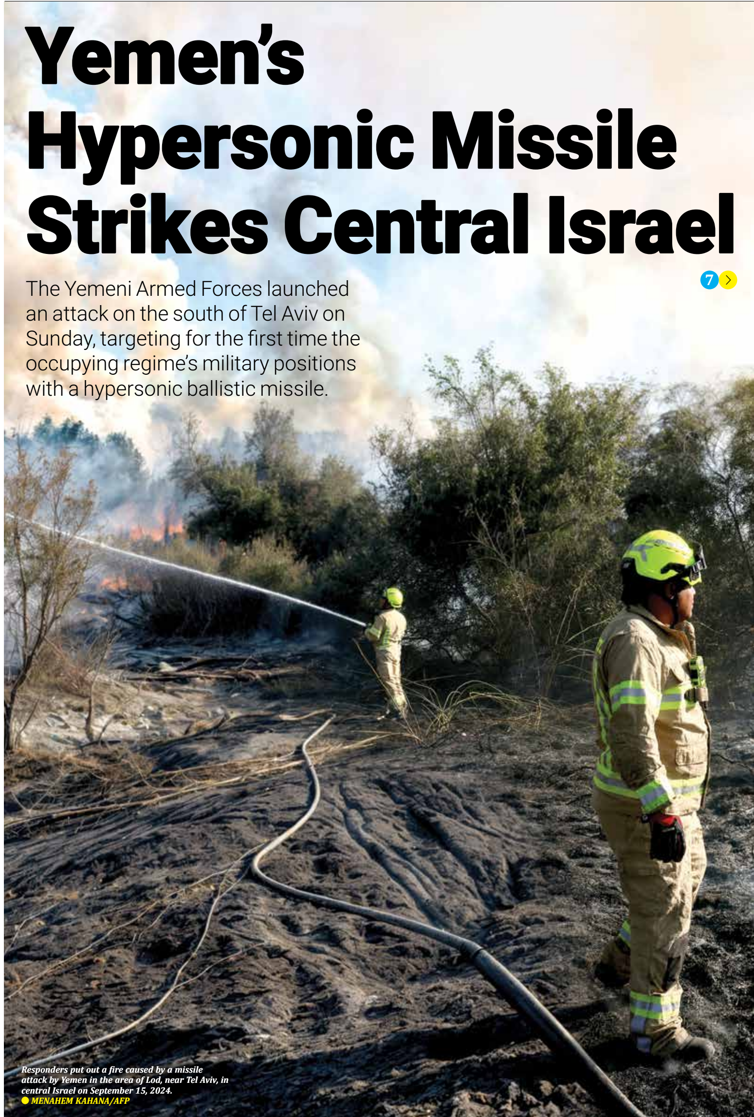
Responders put out a fire caused by a missile attack by Yemen in the area of Lod, near Tel Aviv, in central Israel on September 15, 2024.

The Yemeni Armed Forces launched an attack on the south of Tel Aviv on Sunday, targeting for the first time the occupying regime's military positions with a hypersonic ballistic missile.