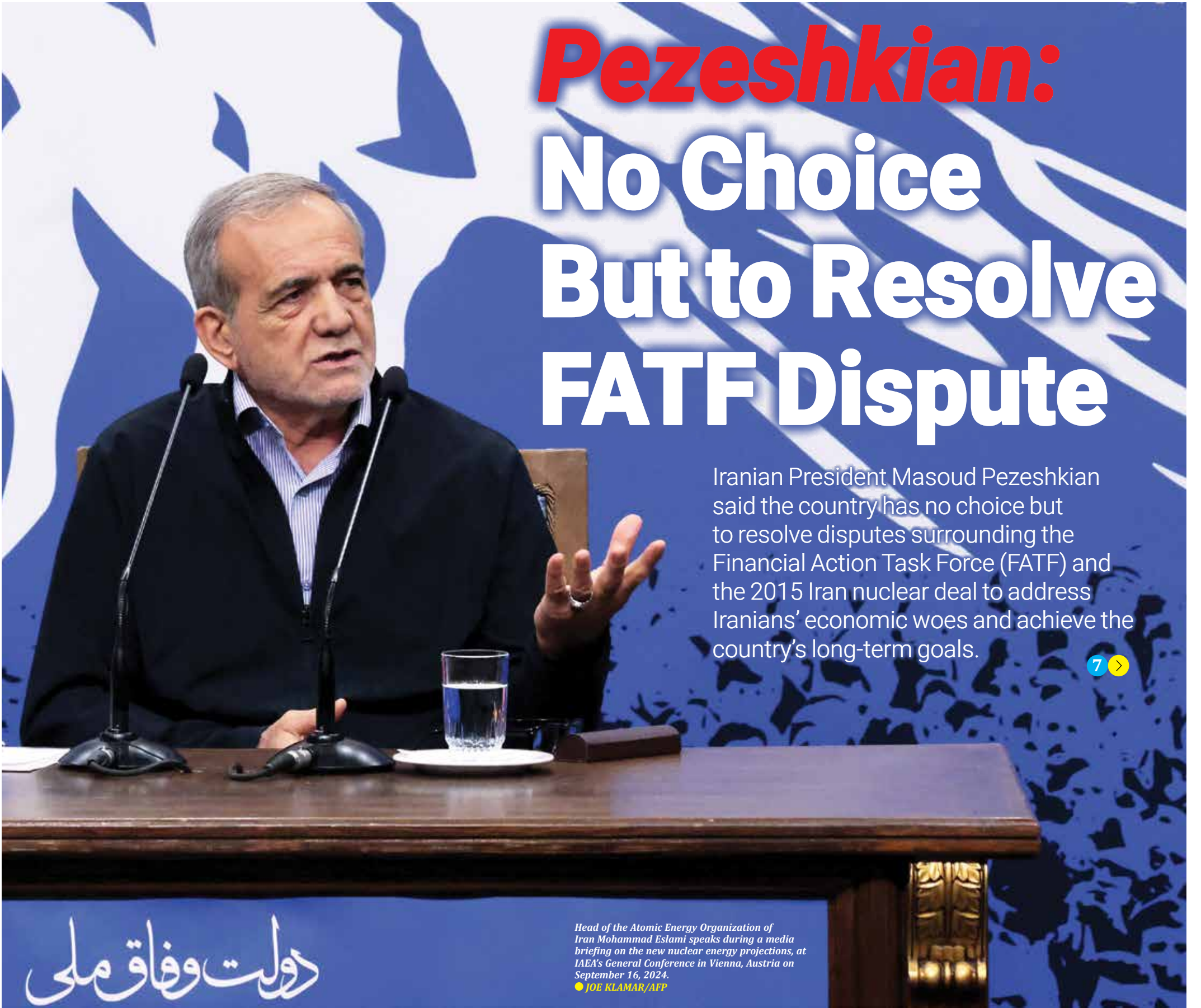
Head of the Atomic Energy Organization of Iran Mohammad Eslami speaks during a media briefing on the new nuclear energy projections, at IAEA's General Conference in Vienna, Austria on September 16, 2024.