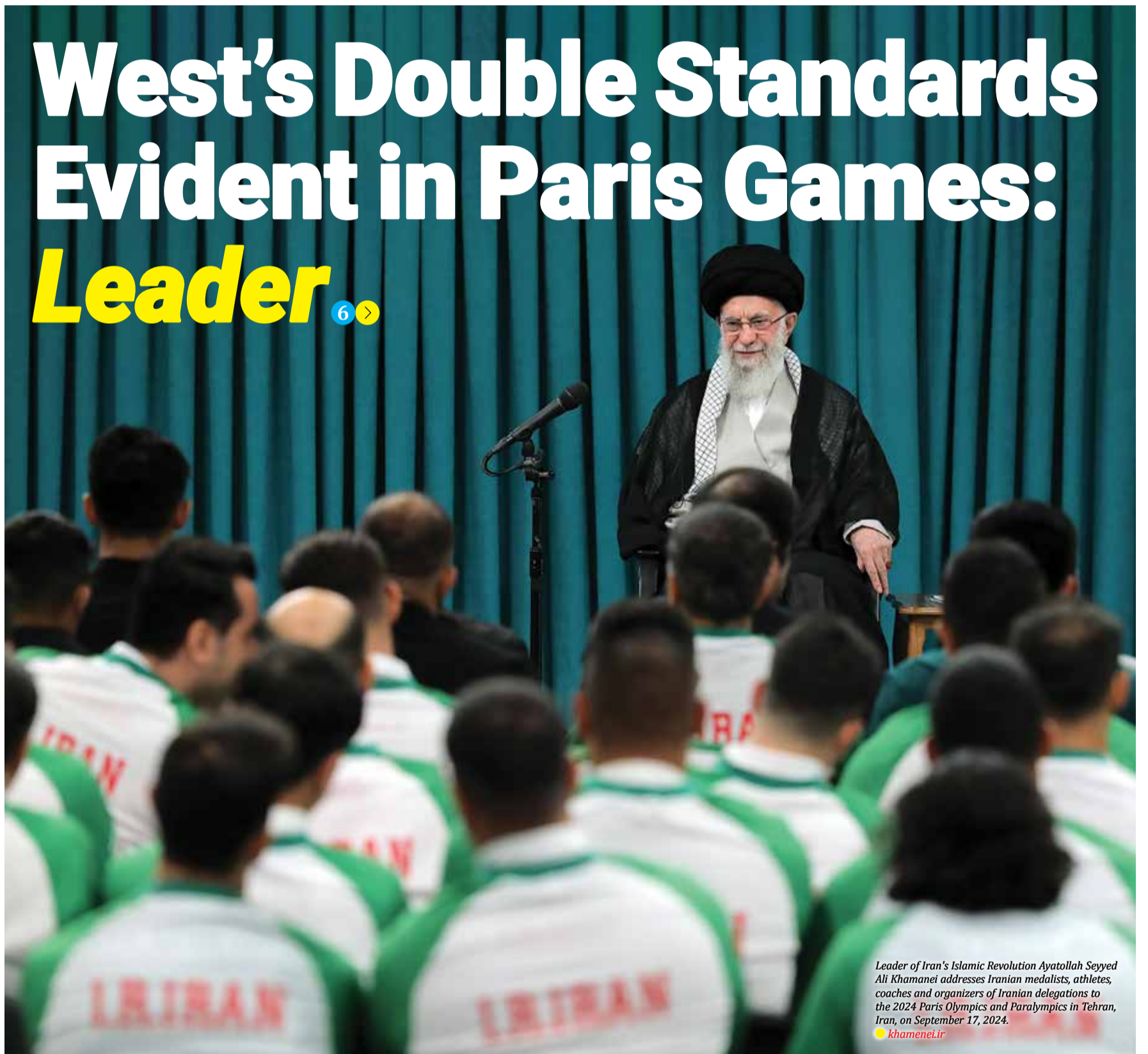
Leader of Iran's Islamic Revolution Ayatollah Seyyed Ali Khamenei addresses Iranian medalists, athletes, coaches and organizers of Iranian delegations to the 2024 Paris Olympics and Paralympics in Tehran, Iran, on September 17, 2024.