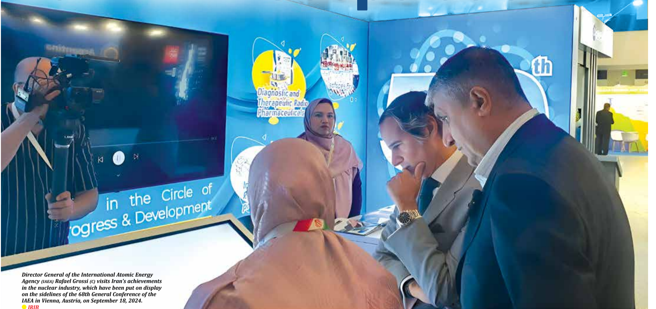
Director General of the International Atomic Energy Agency (IAEA) Rafuel Grossi (C) visits Iran's achievements in the nuclear industry, which have been put on display on the sidelines of the 68th General Conference of the IAEA in Vienna, Austria, on September 18, 2024.