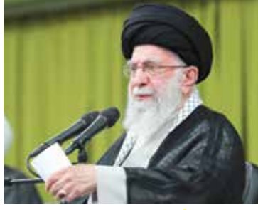
🚽 😑 khamenei.ir

Leader: Muslims should tap inner power to eradicate Israeli cancer