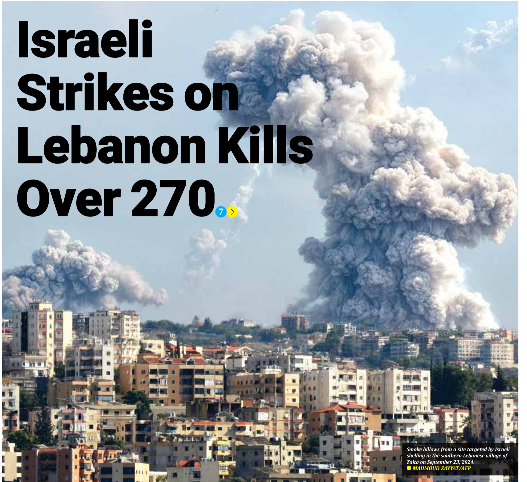
Smoke billows from a site targeted by Israeli shelling in the southern Lebanese village of Zaita on September 23, 2024.