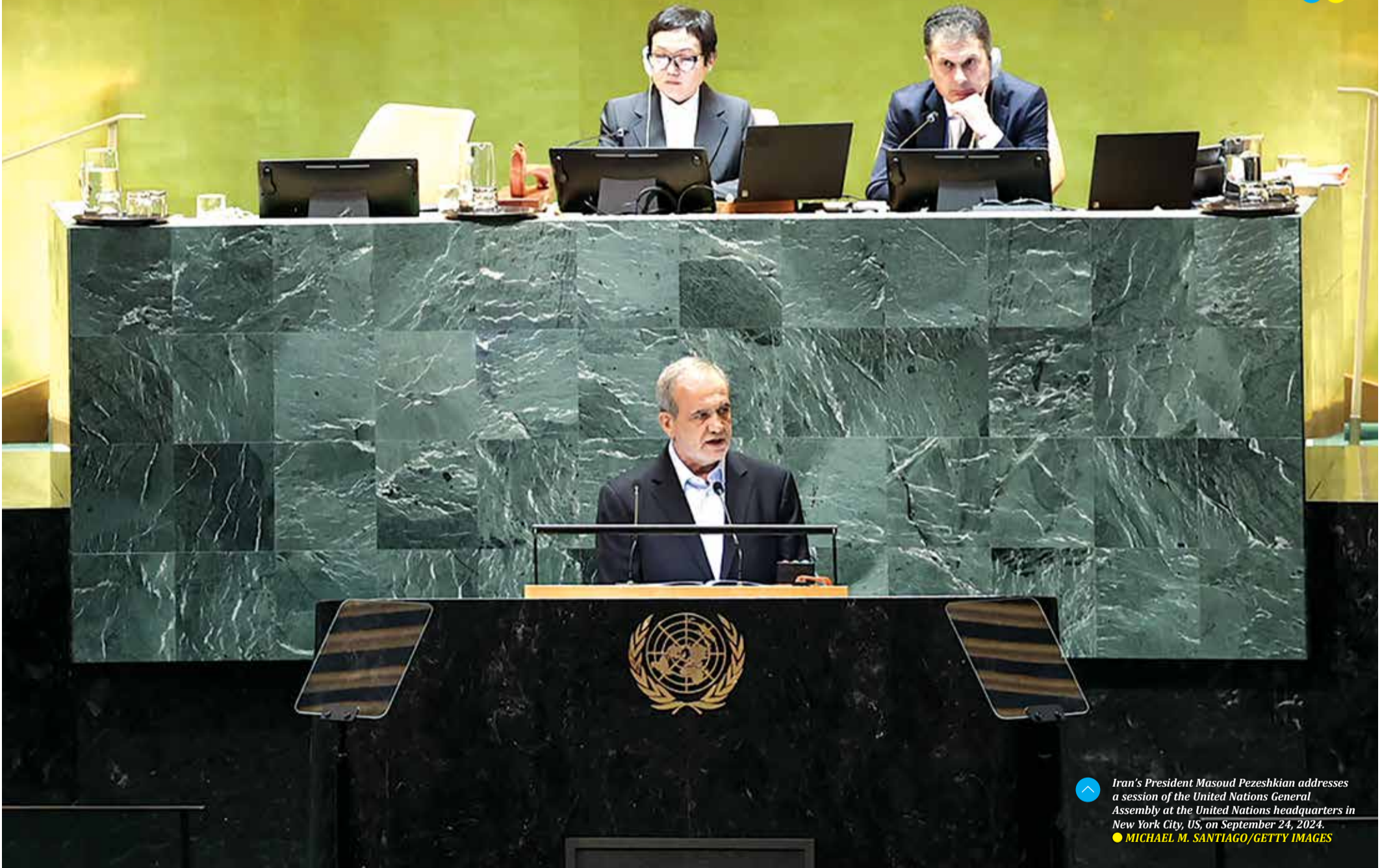
Iran's President Masoud Pezeshkian addresses a session of the United Nations General Assembly at the United Nations headquarters in New York City, US, on September 24, 2024.