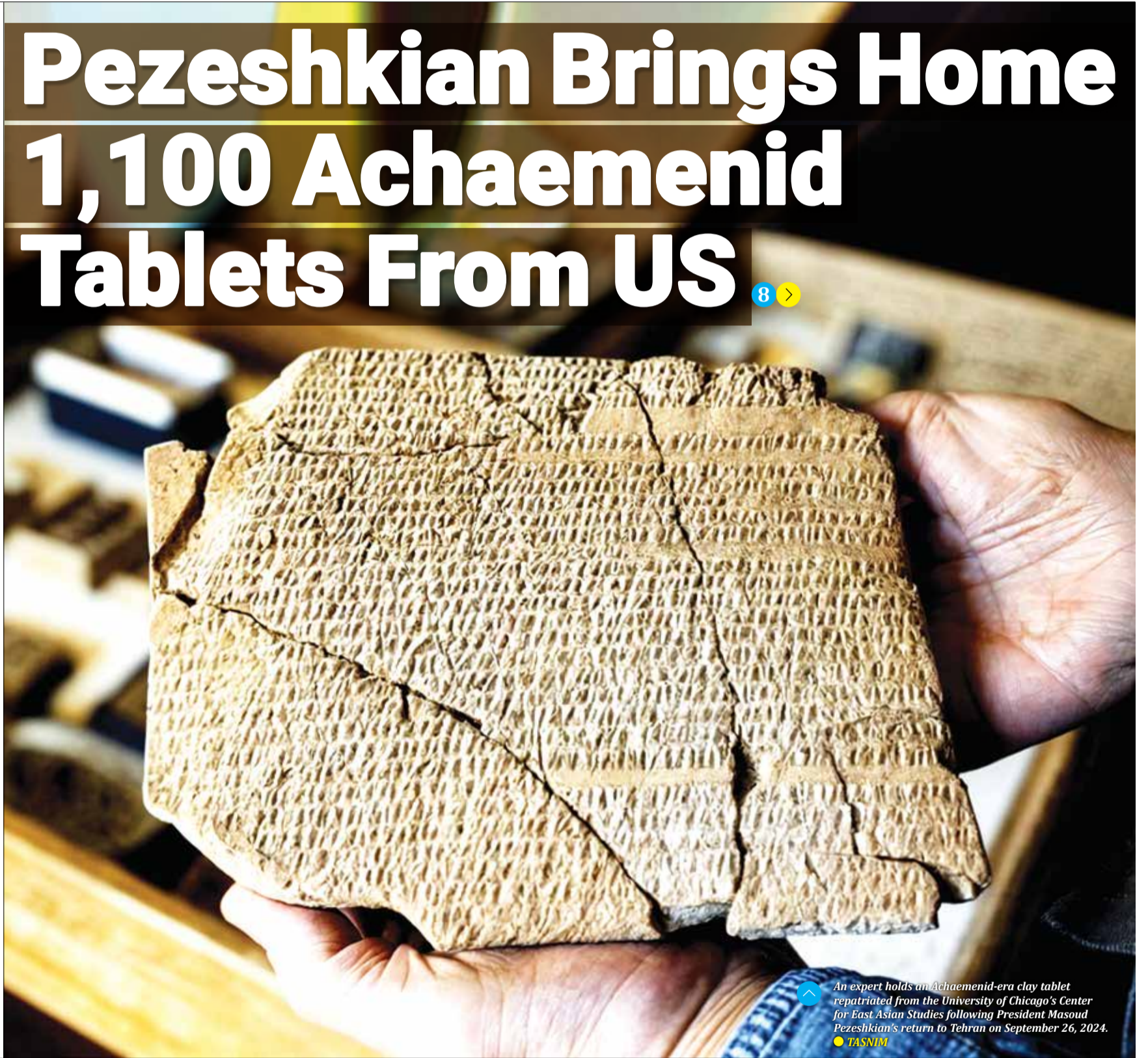
An expert holds an Achaemenid-era clay tablet repatriated from the University of Chicago's Center for East Asian Studies following President Masoud Pezeshkian's return to Tehran on September 26, 2024.