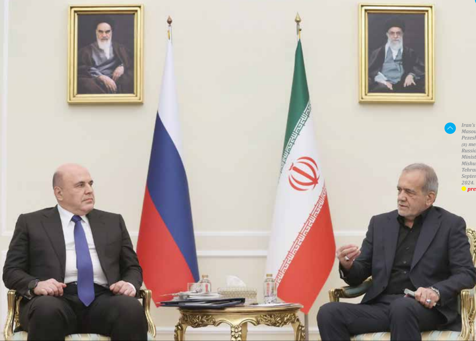
Iran's President Masoud Pezeshkian (R) meets with Russia's Prime Minister Mikhail Mishustin in Tehran on September 30, 2024.