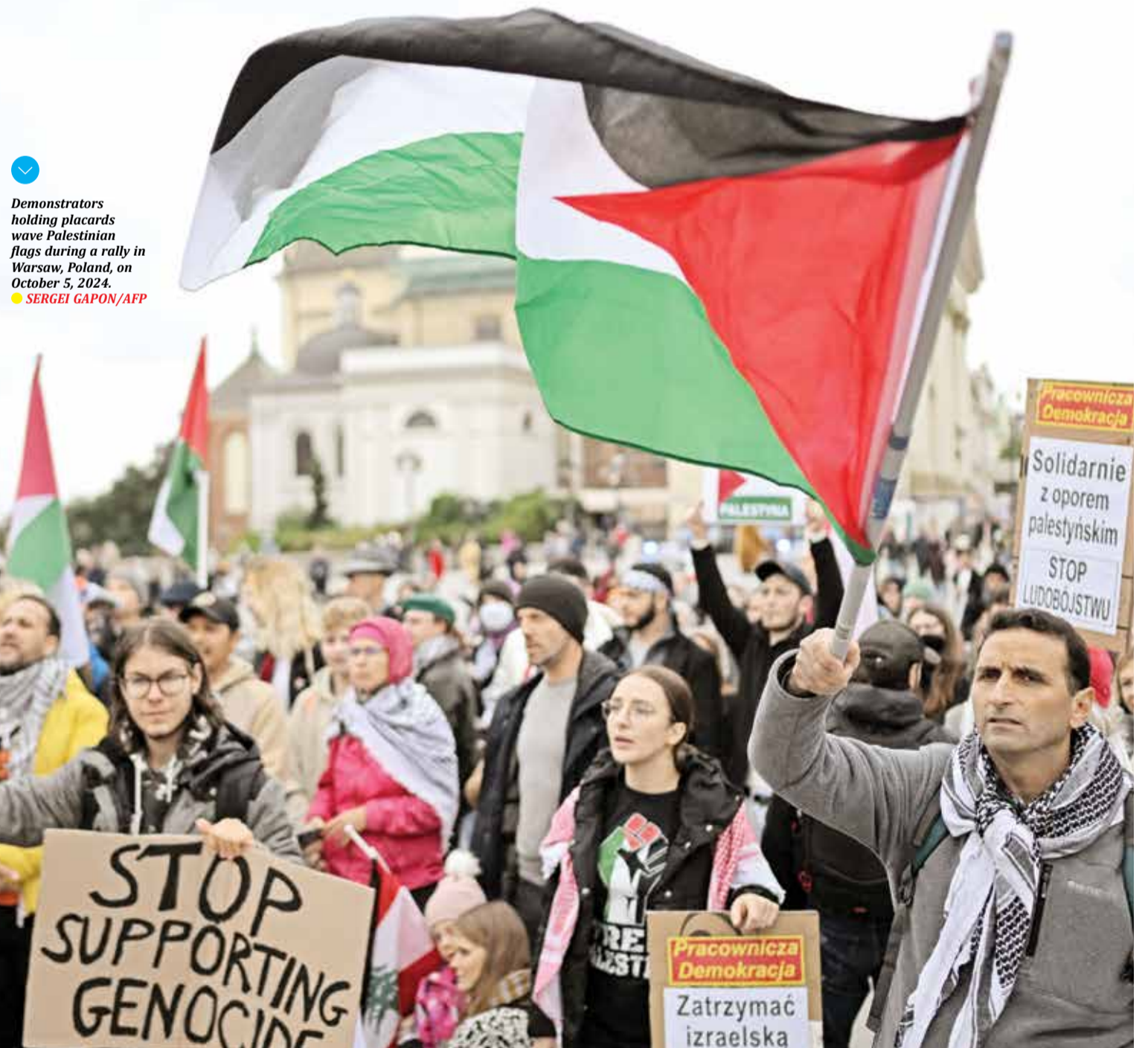
Demotors holding placards wave Palestinian flags during a rally in Warsaw, Poland, on October 5, 2024.

Thousands of pro-Palestinian demonstrators took to the streets in cities across the world on Saturday to call for a cease-fire ahead of the first anniversary of Israel's onslaught on the Gaza Strip on October 7. 7 >