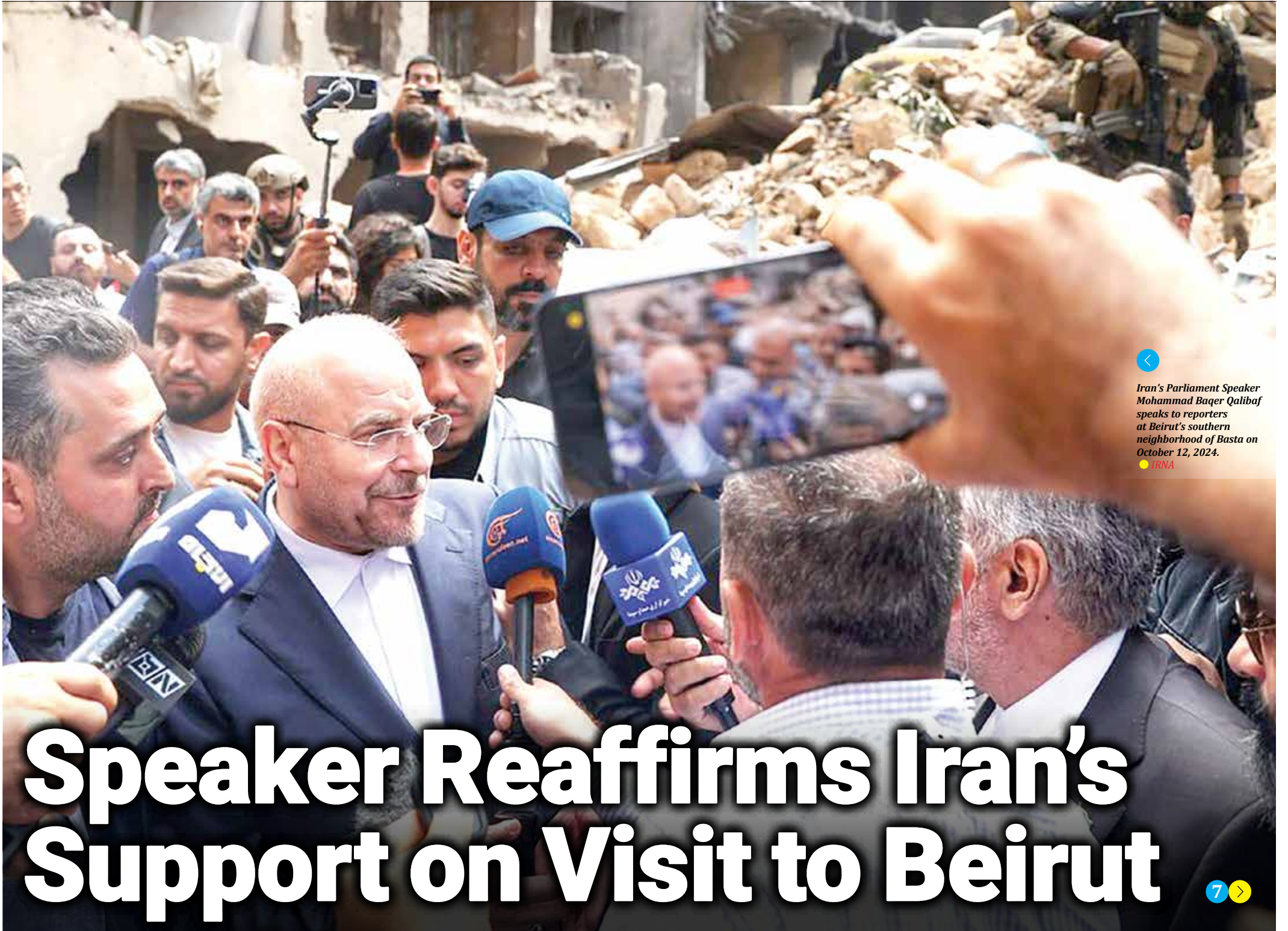
Iran's Parliament Speaker Mohammad Baqer Qalibaf speaks to reporters at Beirut's southern neighborhood of Basta on October 12, 2024.