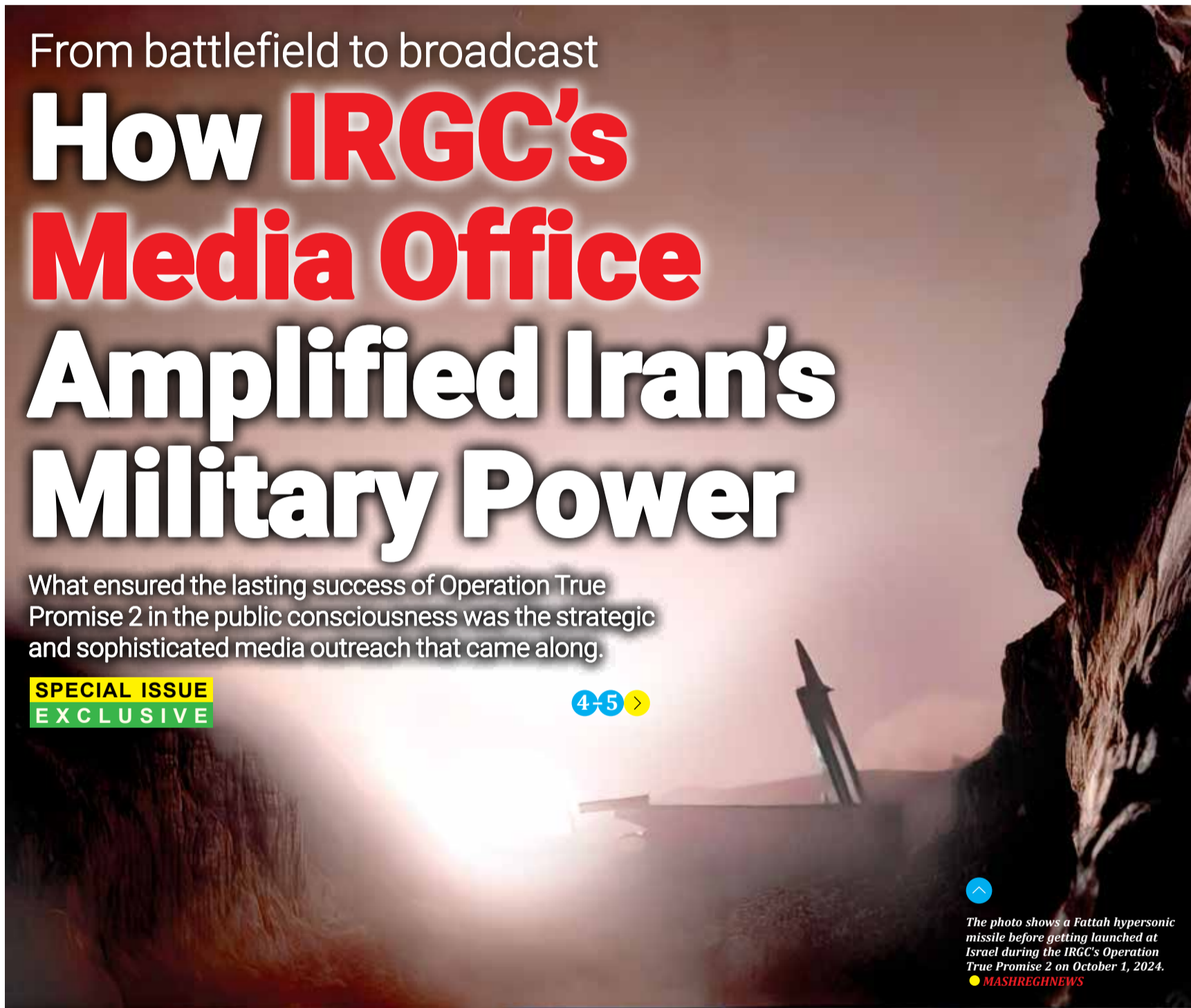
The photo shows a Fattah hypersonic missile before getting launched at Israel during the IRGC's Operation True Promise 2 on October 1, 2024.