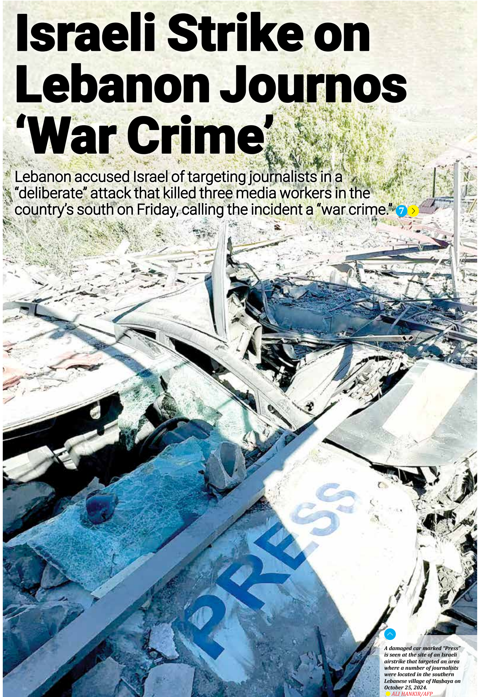
A damaged car marked "Press" is seen at the site of an Israeli airstrike that targeted an area where a number of journalists were located in the southern Lebanese village of Hasbaya on October 25, 2024.