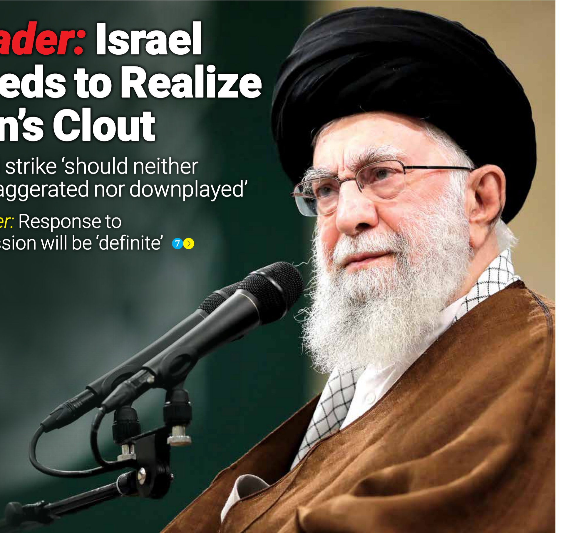
Leader of Iran's Islamic Revolution Ayatollah Seyyed Ali Khamenei addresses a group of people in Tehran, Iran, on October 27, 2024.

Speaker: Response to aggression will be 'definite' 7 >