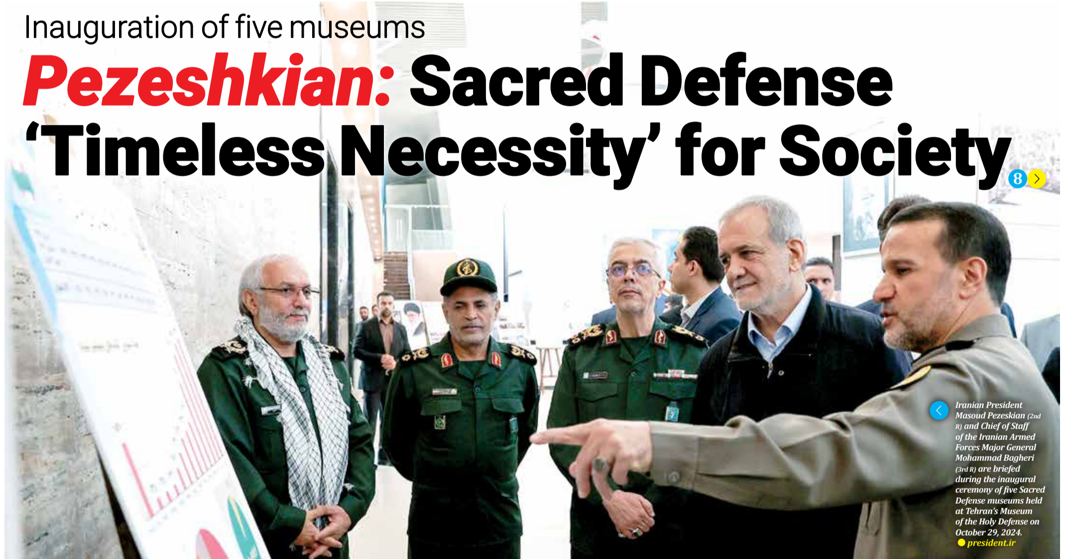
Iranian President Masoud Pezeshkian (2nd R) and Chief of Staff of the Iranian Armed Forces Major General Mohammad Bagheri (3rd R) are briefed during the inaugural ceremony of five Sacred Defense museums held at Tehran's Museum of the Holy Defense on October 29, 2024.