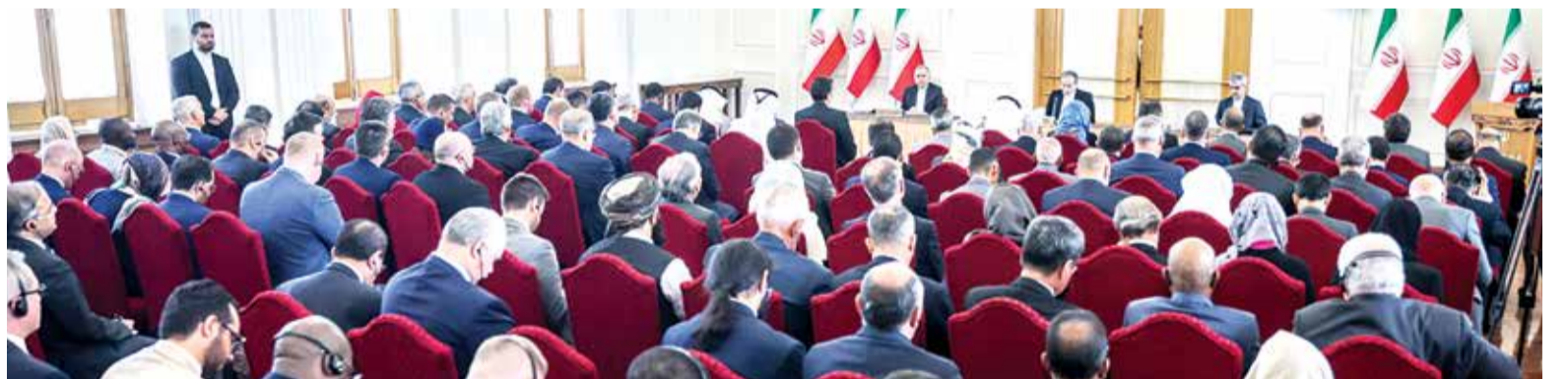
Iran's Foreign Minister Abbas Araghchi (c) addresses a gathering of ambassadors and heads of foreign missions in Tehran on October 29, 2024.