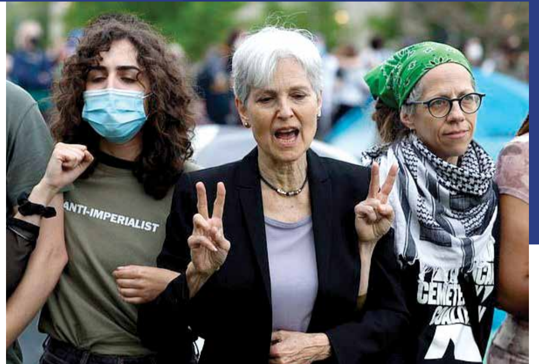
Jill Stein (c) is seen linking arms with anti-Israel protesters before being arrested on Washington University's campus in St. Louis, Missouri, on April 27, 2024.

We're spending half of our congressional budget on the endless war machine and the Pentagon. If you add up the costs of taking care of our wounded soldiers for the Veterans Administration, nuclear weapons as part of the Department of Energy, the FBI, customs, and border protection, it's more like 60–65% of the budget. It is just like robbing us blind.