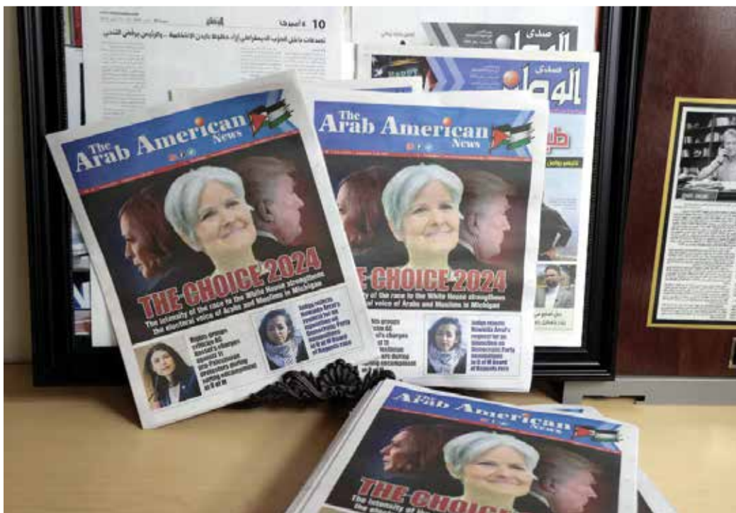
The front cover of the Arab American News, with pictures of presidential candidates Jill Stein (c), Kamala Harris (l), and Donald Trump, is seen in the newspaper's office in Dearborn, Michigan, on September 18, 2024.

"We don't have to wait for Donald Trump for fascism to arrive in this country when the heads of peaceful protesters are being bashed in on college campuses simply because they are expressing the will of the people and the rulings of the International Court of Justice. Making a case for Donald Trump being better or worse is absolutely nonsense. We have two greater evil candidates; there is no lesser evil." — Jill Stein