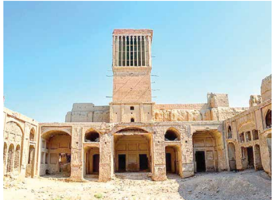
Haji Darvish House