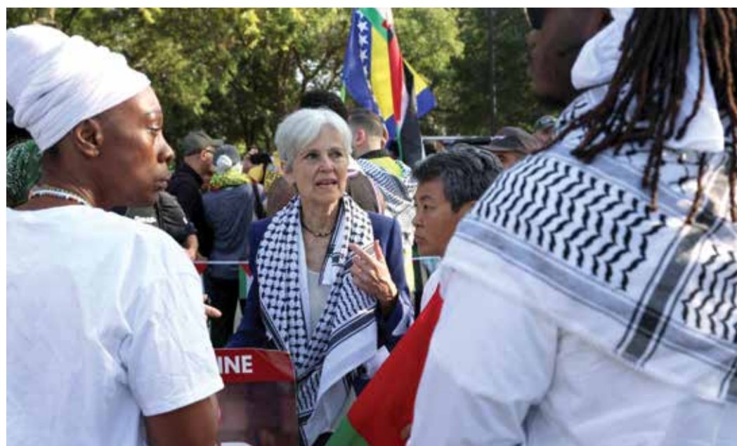
Jill Stein talks with demonstrators during a protest in support of Palestinians in Gaza, on the sidelines of the Democratic National Convention (DNC) in Chicago, Illinois, on August 21, 2024.

Three sets of American laws are being violated by delivering aid to Israel. It is illegal to send aid to any country that is violating human rights, interfering with the delivery of humanitarian aid, and not