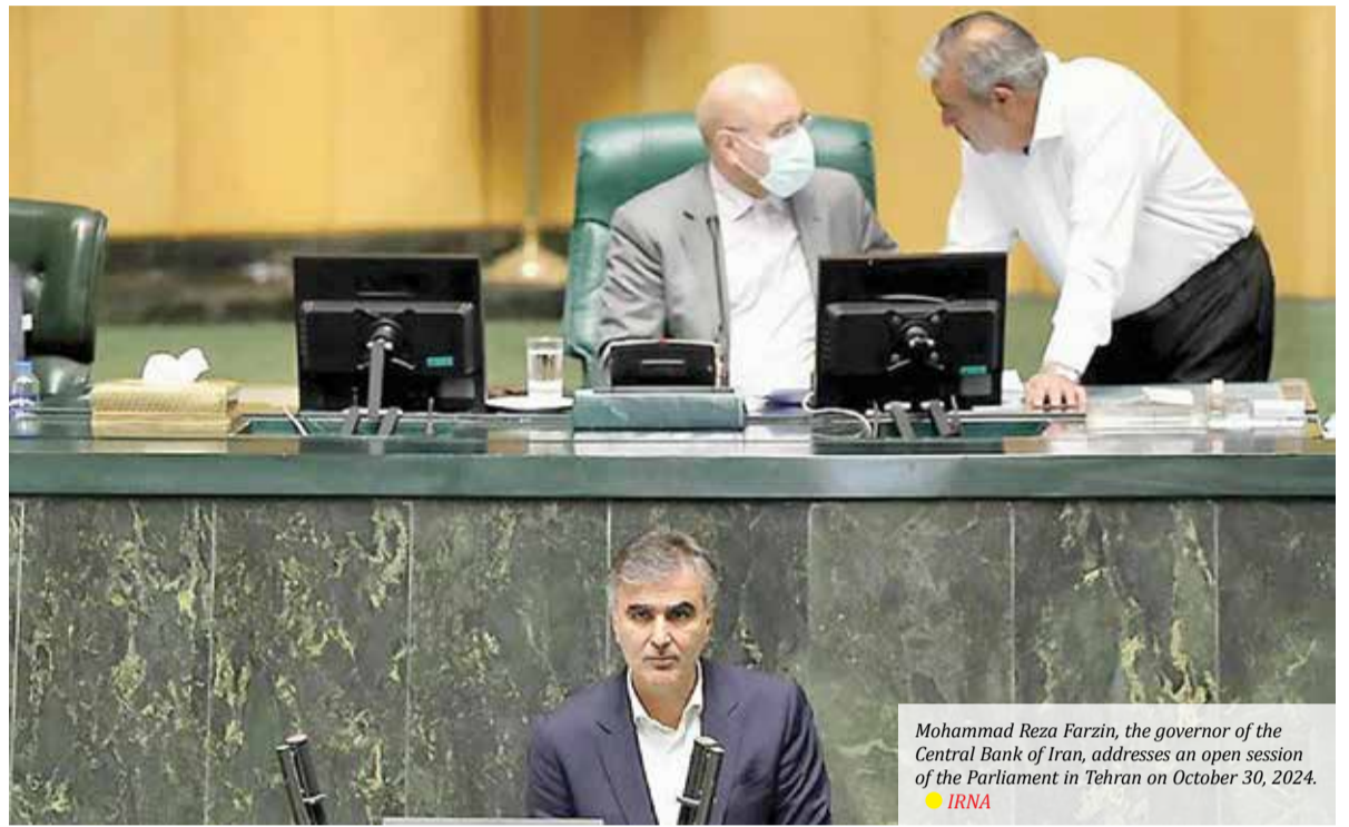
Mohammad Reza Farzin, the governor of the Central Bank of Iran, addresses an open session of the Parliament in Tehran on October 30, 2024.

During the parliament session, Farzin explained that the World Bank has recommended that member states may increase their quotas by as much as 50 percent, warning that if the Islamic Republic's share does not increase, others will increase their capital, and Iran will lose its leadership in the IMF after 50 years.