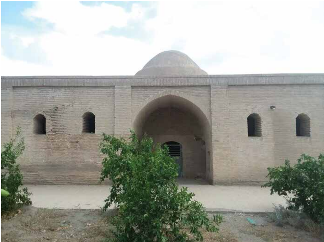
Tomb of Salar Reza