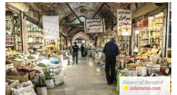
Bazaar of Borujerd ● salameno.com

garded as one of the most historically significant cities in Iran, successfully preserving its heritage, chtn.ir wrote.