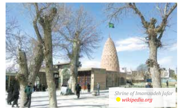
Shrine of Imamzadeh Jafar