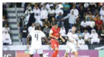
AFC Champions League Elite: