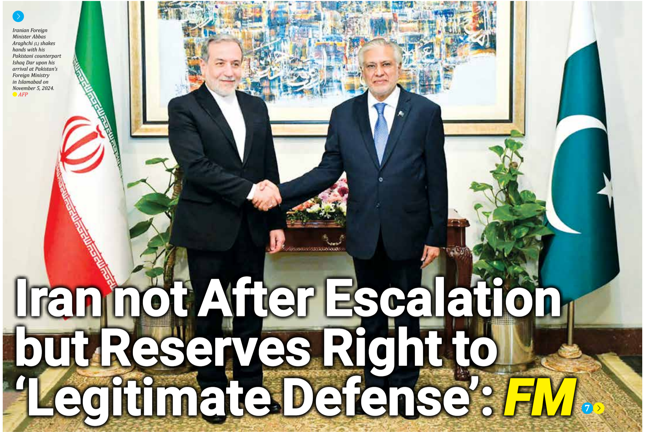
Iranian Foreign Minister Abbas Araghchi (L) shakes hands with his Pakistani counterpart Ishaq Dar upon his arrival at Pakistan's Foreign Ministry in Islamabad on November 5, 2024.