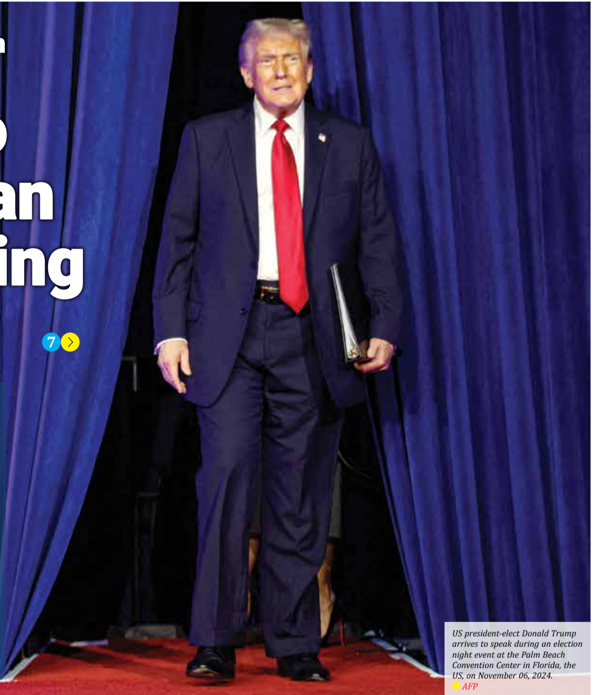
US president-elect Donald Trump arrives to speak during an election night event at the Palm Beach Convention Center in Florida, the US, on November 06, 2024.

Trump's withdrawal from the JCPOA in 2018 and the subsequent assassination of Iran's General Qassem Soleimani severely damaged relations between Washington and Tehran. During Biden's tenure, Trump criticized the Democrats for turning a blind eye on Iran's oil sales, attributing it to their ineptitude. Meanwhile, he has promised Americans that he will strike a deal with Iran that benefits the US. In Tehran, officials insist that whoever occupies the White House has little bearing on the country's policies. However, experts have different opinion's. Page 2 > Here is what some Iranian analysts have to say about the impact of Trump's presidency on Iran: