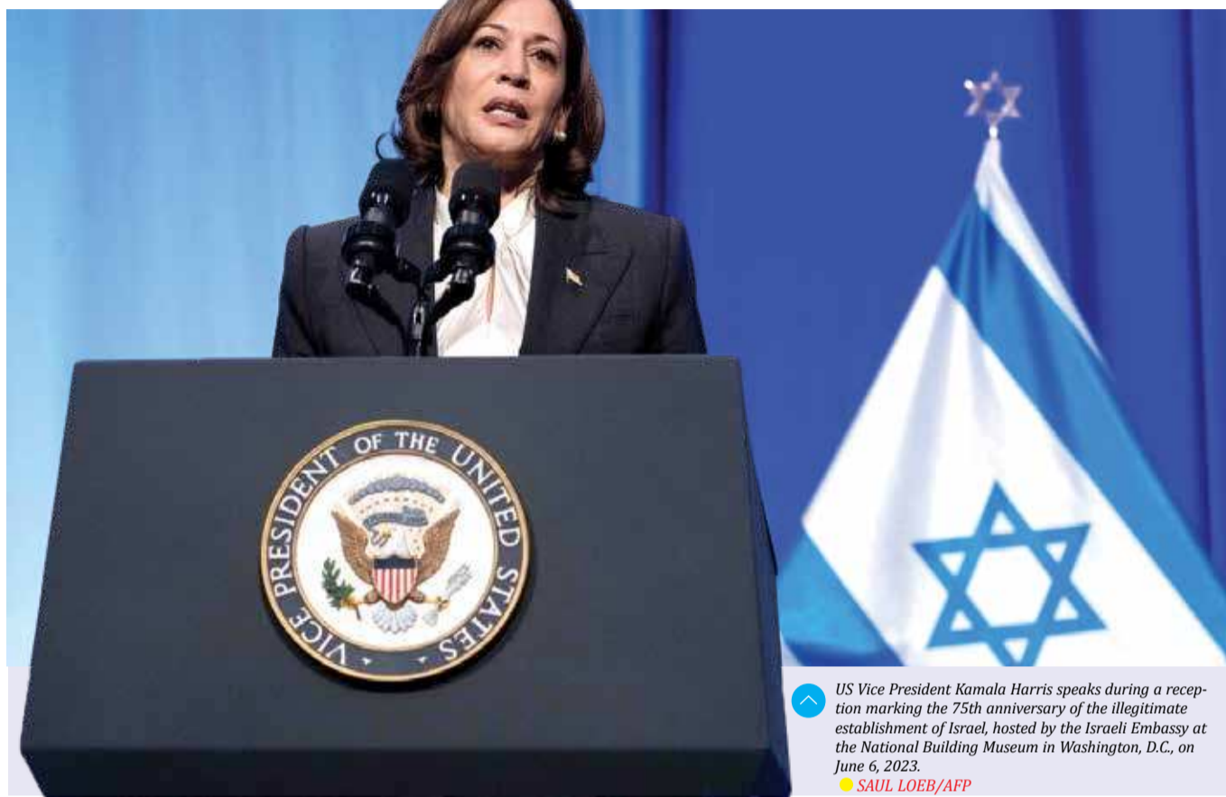
US Vice President Kamala Harris speaks during a reception marking the 75th anniversary of the illegitimate establishment of Israel, hosted by the Israeli Embassy at the National Building Museum in Washington, D.C., on June 6, 2023.