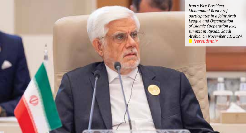
Iran's Vice President Mohammad Reza Aref participates in a joint Arab League and Organization of Islamic Cooperation (OIC) summit in Riyadh, Saudi Arabia, on November 11, 2024.

Israel should respect Iran’s sovereignty, refrain from aggression: MBS