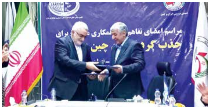
Hormatollah Rafiei (R), head of the Association of Air Transport and Tourist Agencies of Iran, and Alaaeddin Boroujerdi, Chairman of the Iran-China Friendship Association, exchange documents after signing a five-year cooperation agreement aimed at strengthening tourism ties between the two countries.