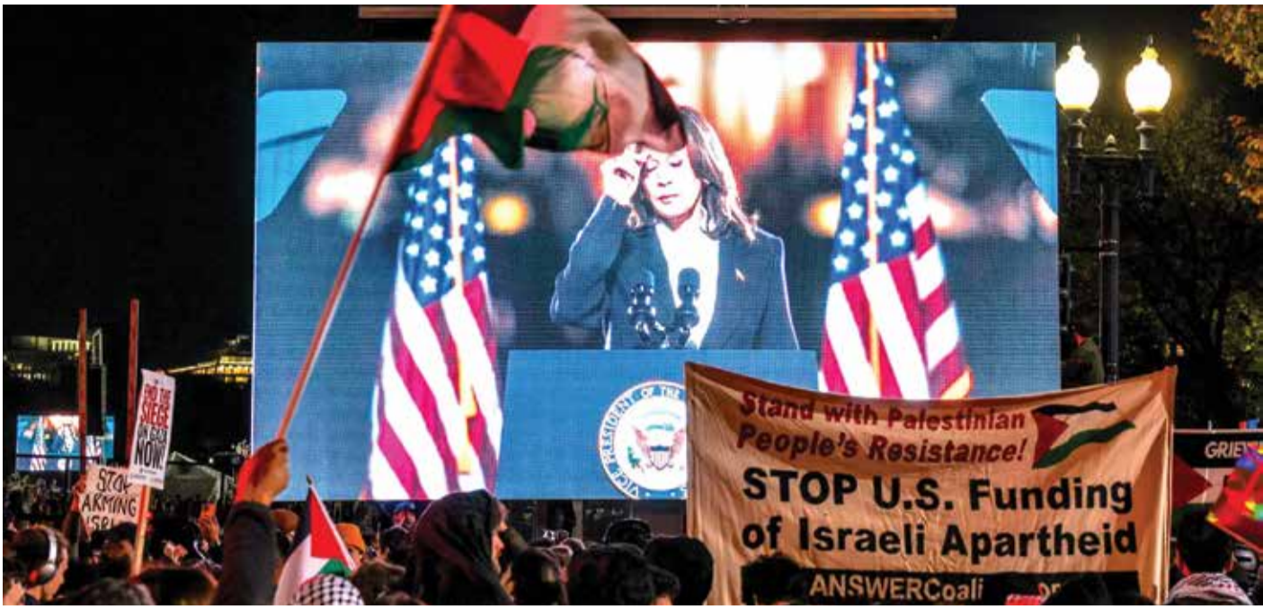
Protesters wave Palestinian flags and anti-genocide banners while Kamala Harris speaks on the Ellipse in Washington, D.C., on October 29, 2024.

US voters opposing Israel’s genocide in Gaza openly declared that they would not support the Democratic party and the outgoing administration, which provided Israel a record $17.9 billion in military aid during the first year of the war, according to a report from Brown University’s Costs of War Project.