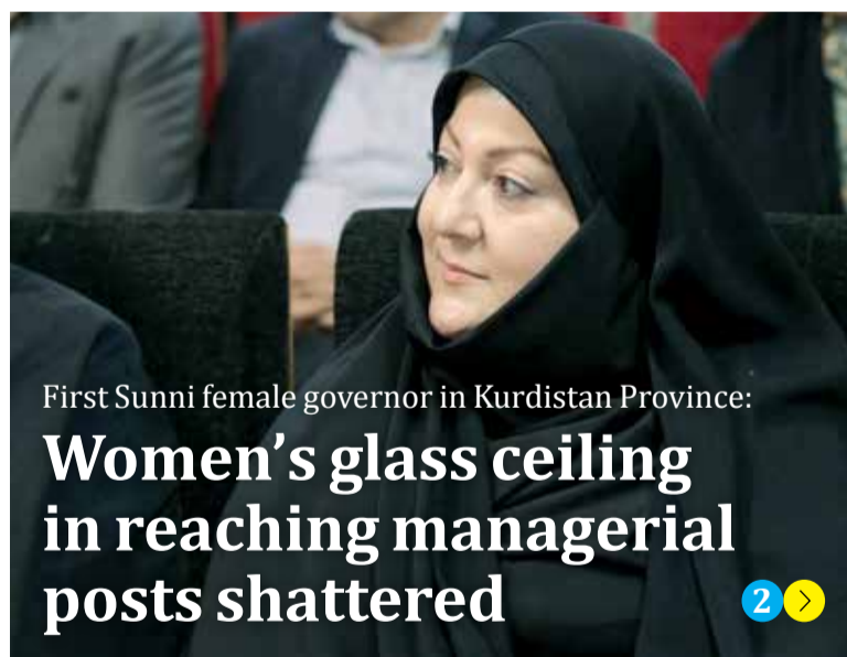
First Sunni female governor in Kurdistan Province:

During his election campaign, Trump repeatedly flagged his main concern about Iran as preventing it from acquiring nuclear weapons. After the election results were announced, Brian Hook, who served as the US special representative for Iran in Trump's previous administration, stated that Trump has no intention of regime change in Iran. Page 8 >