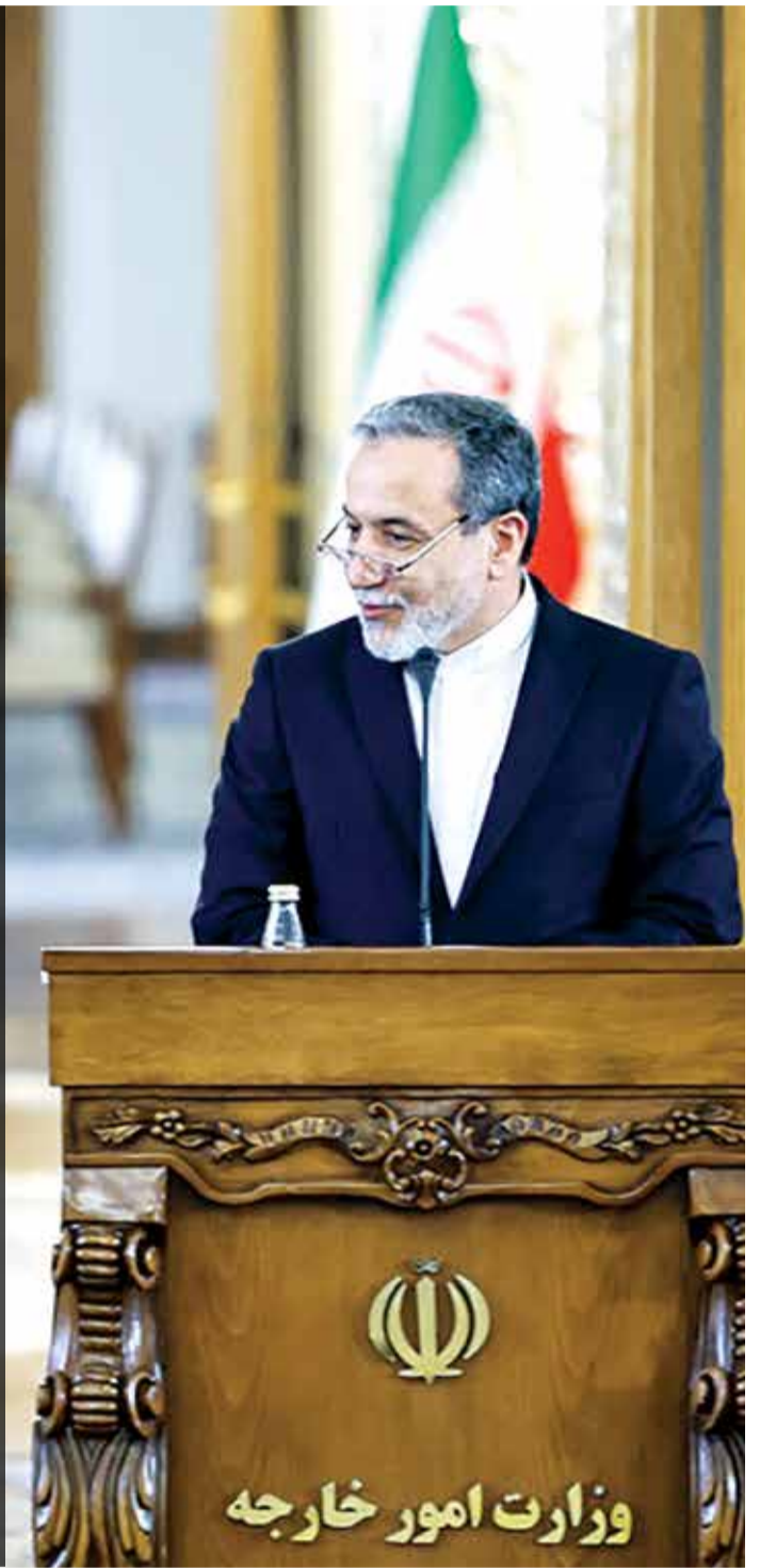
Iranian Foreign Minister Abbas Araghchi (l) and his Syrian counterpart Bassam al-Sabbagh hold a joint press conference in Tehran, Iran, on November 19, 2024.

US Advised to Adopt 'Maximum Rationality' Rather Than 'Maximum Pressure': Araghchi