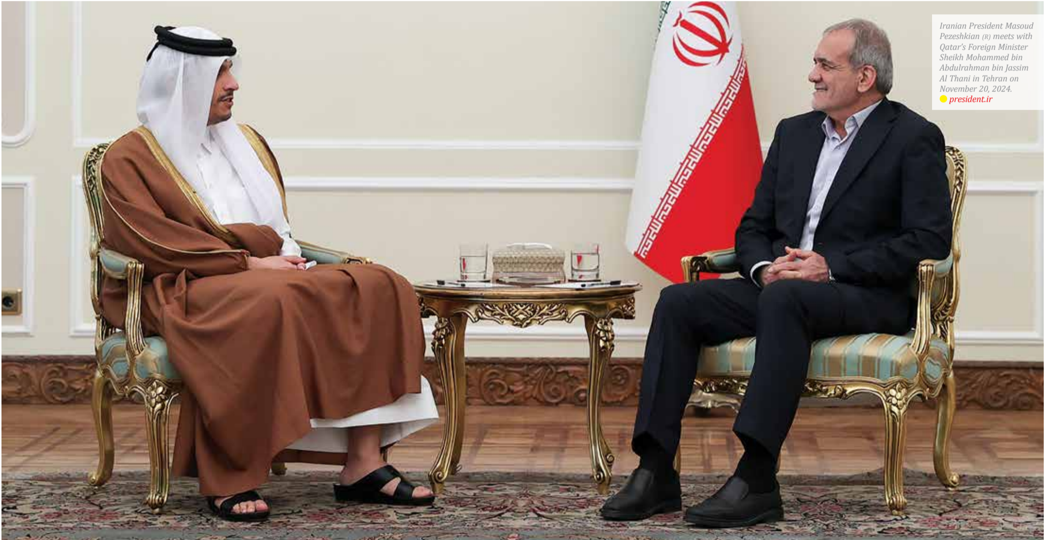
Iranian President Masoud Pezeshkian (R) meets with Qatar's Foreign Minister Sheikh Mohammed bin Abdulrahman bin Jassim Al Thani in Tehran on November 20, 2024.