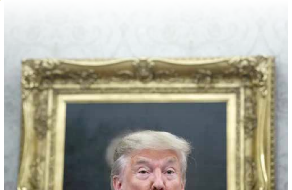
Donald Trump in the Oval Office of the White House on Oct. 08, 2019.

Predictably, Joe Biden and Antony Blinken followed the "shock and awe" gang's ruinous footprints by giving the indicted prime minister of Israel, Benjamin Netanyahu, all the money, arms, and "strategic" cover he required to commit genocide in Gaza and the occupied West Bank. Biden, Blinken and United Nations Ambassador Lin-