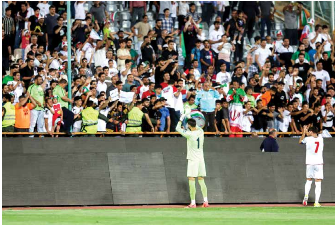
● ALI SHARIFZADEH/IRNA

"It is evident that the situation that led to the suspension of all international and domestic flights for approximately 36