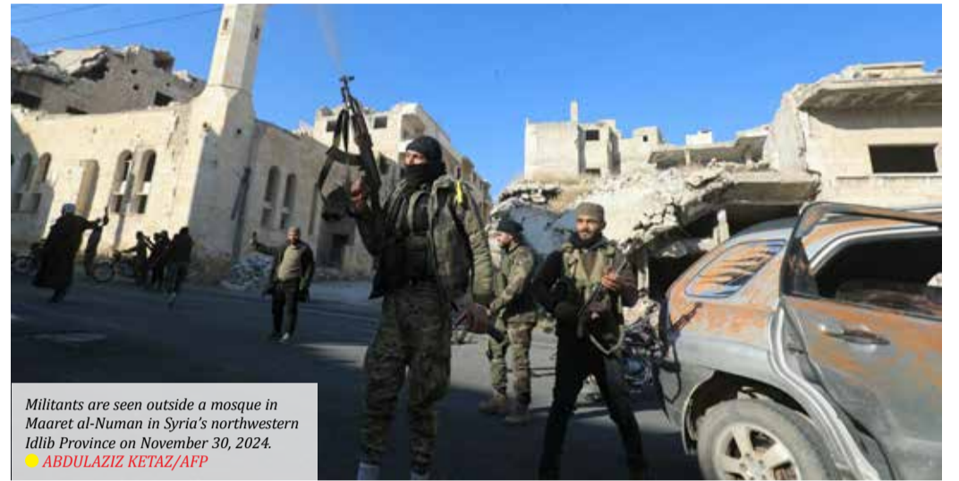
Militants are seen outside a mosque in Maaret al-Numan in Syria's northwestern Idlib Province on November 30, 2024.

Syrian president in a phone call with an official from the breakaway Georgian republic of Abkhazia said, "Terrorism only understands the language of force,