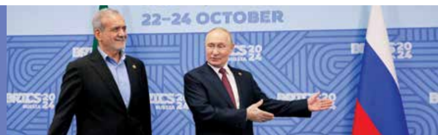
President of Iran Masoud Pezeshkian (l) and his Russian counterpart, Vladimir Putin

In general, and considering what has been stated, securing our country's national interests in 2025 requires an accurate understanding of global developments, intelligent strategic planning, and coherent implementation of developed policies. On this path, maintaining national cohesion, strengthening domestic capacities, expanding international cooperation, and maintaining flexibility in the face of unexpected domestic and foreign developments will be the keys to success.