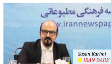
Sasan Karimi ● IRAN DAILY

It's possible that they will put a new agreement on the table that covers various topics of interest to them, including nuclear, defense, and regional policies of Iran. However, Iran's position on non-nuclear issues, namely defense and regional policies, is clear, just as the negotiations leading to the JCPOA only focused on nuclear issues and did not directly address other topics. More time needs to pass to see in which direction the talks will go. I think neither Trump is the same as the previous Trump, nor is Europe, nor even Iran. The differences between Europe and Trump's America on issues like NATO and Ukraine are serious, but it's possible that they may see the Iran issue as a common ground to prevent their differences from deepening.