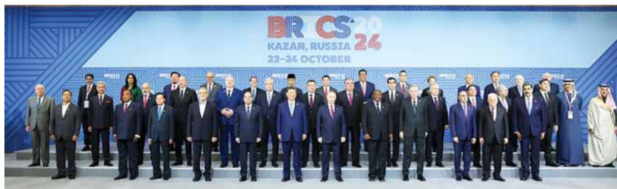
Iran's President Masoud Pezeshkian (front row, 4th-L), leaders and representatives of other BRICS+ countries and guest countries, and heads of international organizations pose for a group photo during the BRICS Plus leaders' dialogue in Kazan, Russia, on October 24, 2024.

The full article first appeared on Fair Observer.